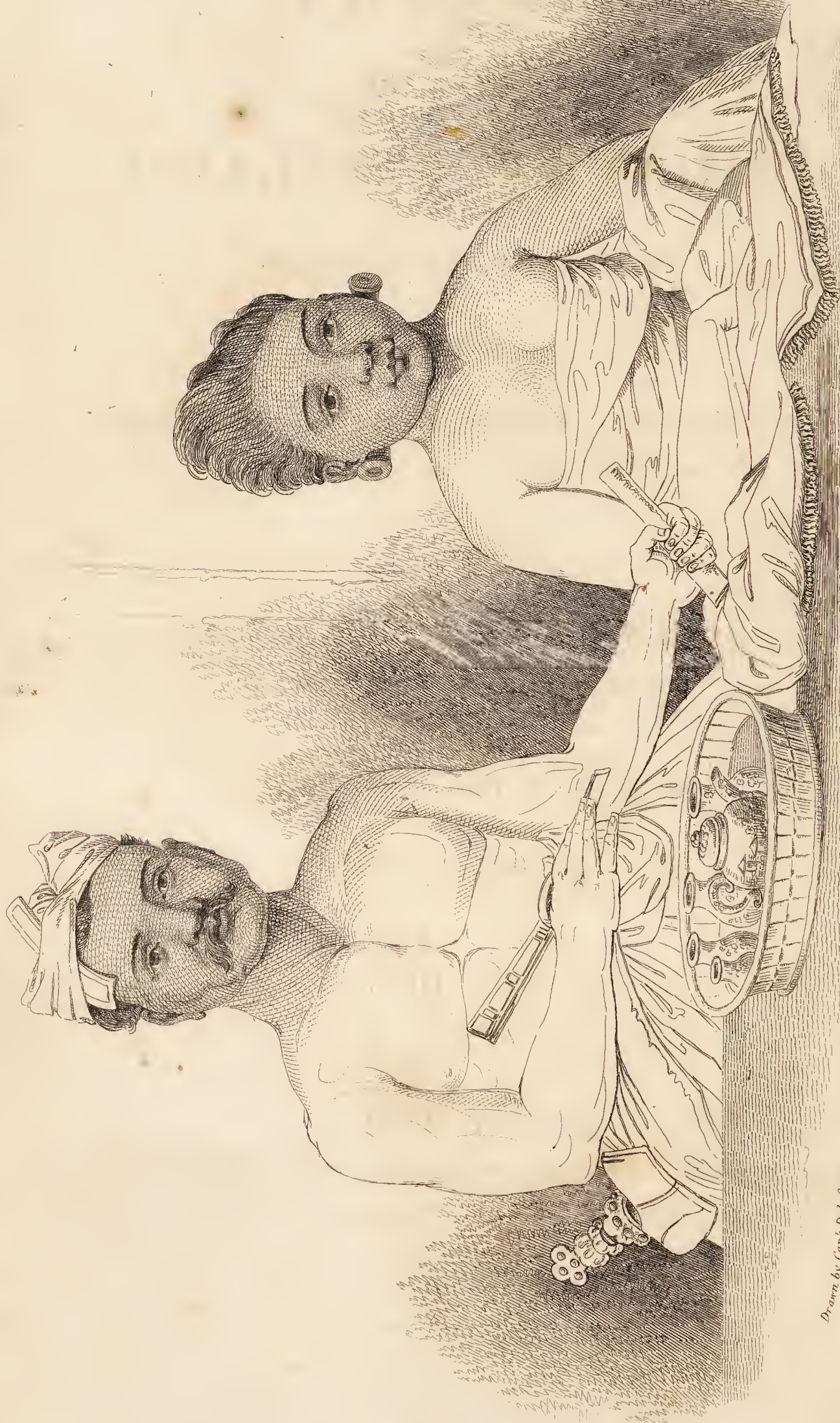
Drawn by Cap. Delafosse