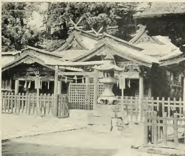
SHINTO SHRINE ON SUMMIT OF USUITOGE