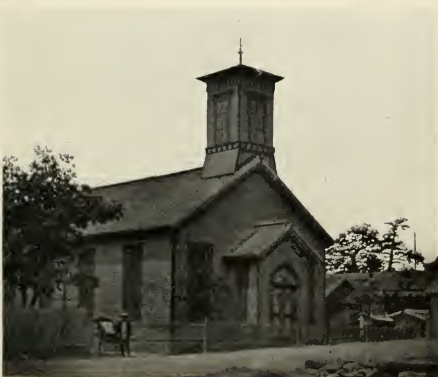
METHODIST CHURCH ON DESHIMA, NAGASAKI