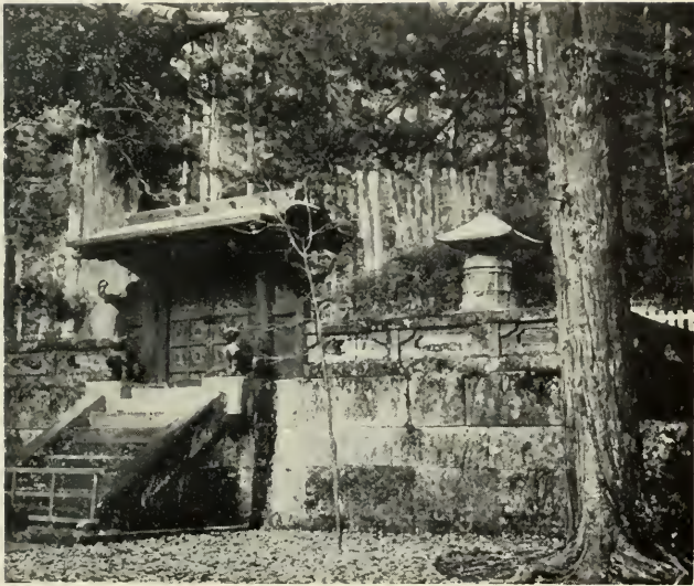
TOMB OF IEYASU AT NIKKO (see page 55)