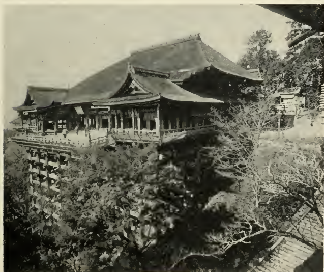
KIYOMIZU TEMPLE (Buddhist) IN KYOTO