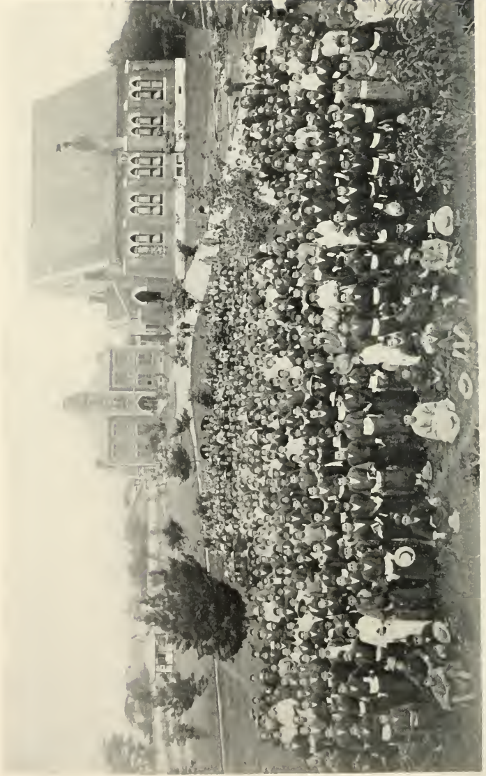
JAPAN'S FIRST STUDENT CONFERENCE ON DOSHISHA UNIVERSITY CAMPUS