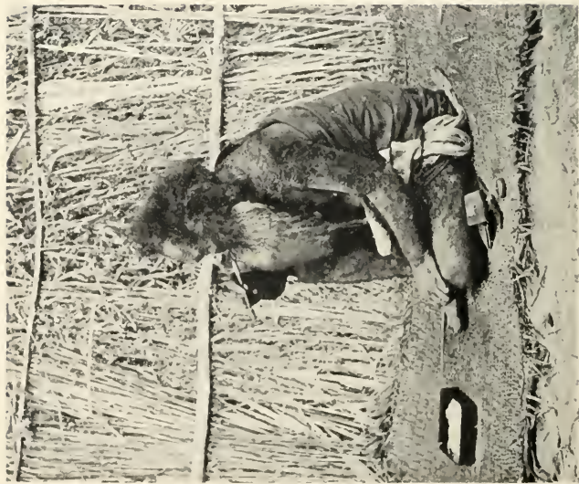
A HAIRY MAN OF THE AINU TRIBE