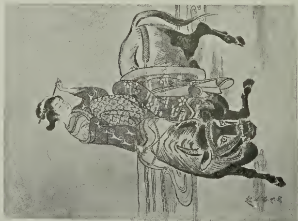
No. 14. Harunobu.