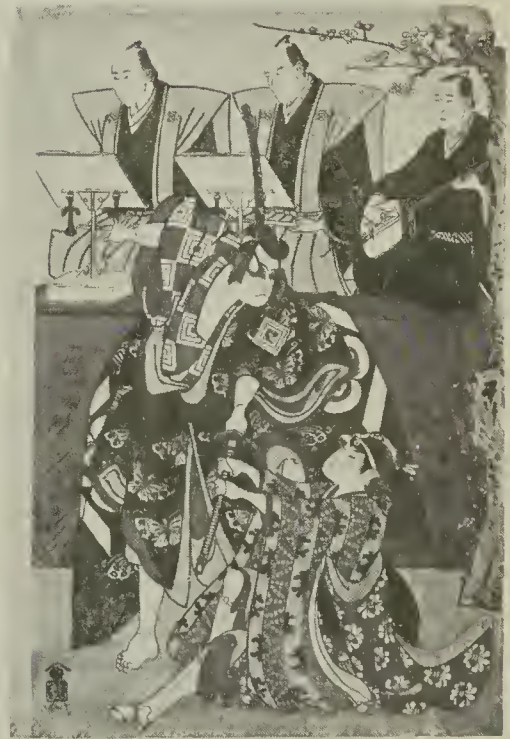
No. 191. Shunzan. No. 217. Toyohiro.