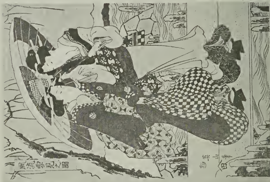
Plate 2. No. 247. Yeizan.