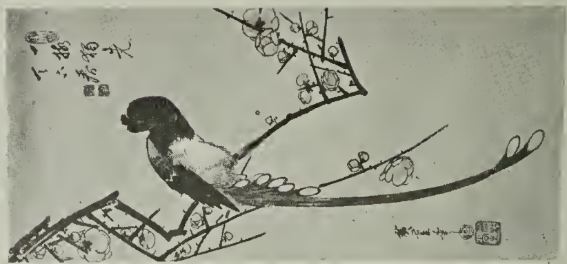
No. 65. Hiroshige.