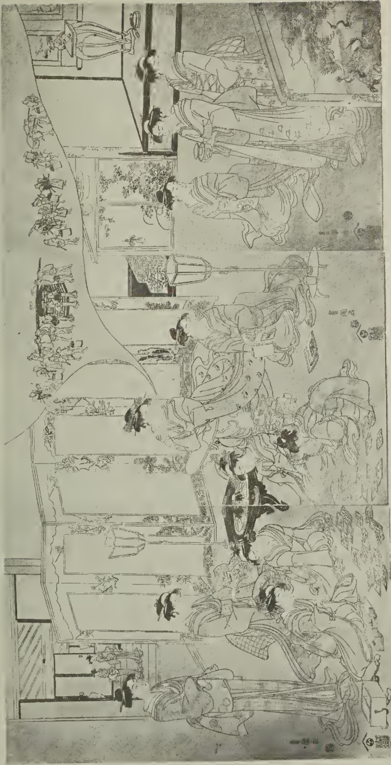
Plate 5. No. 219. Toyokuni. A Dreaming Princess.