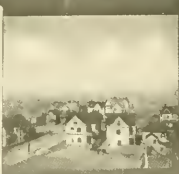
BIRDSEYE VIEW OF ROANOKE FROM MAATZLIAN'S RESIDENCE.