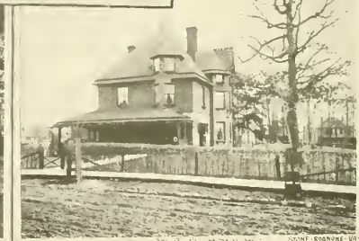
W. W. WELLS STONE SCARPER - WELLS