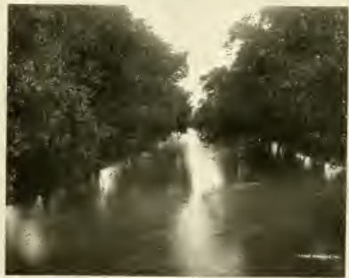
R. IN THE RIVER