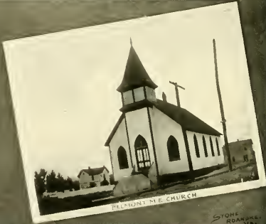
DELINANT M.E. CHURCH