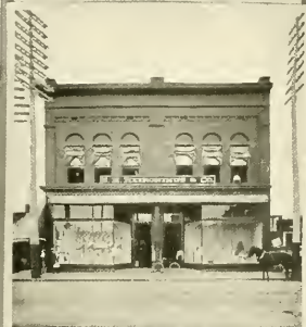
HOTEL ST. DAVID