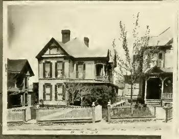
W. S. S.