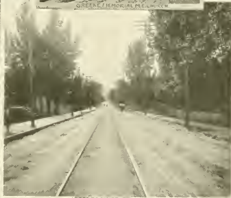
JEFFERSON ST. FROM S.W. CORNER