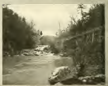
Scenes about Hollins Institute, near Roanoke.