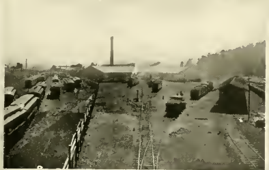
SHOPS AND WORKS RANDOLPH ST BRIDGE