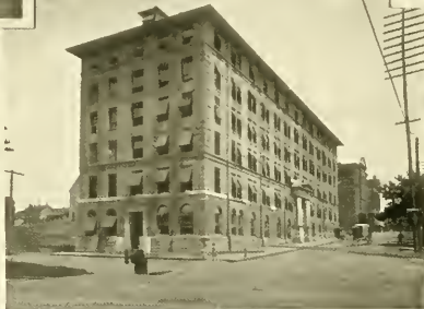
COMMERCIAL OFFICE BUILDING