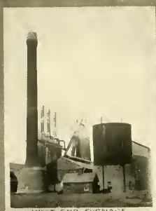
WEST END FURNACE