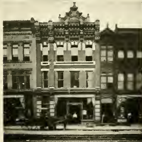
STONE ROANOKE, VA.