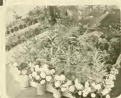
FROM THE ROANOKER FLOWER SHOW