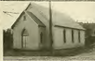
THE BRISTOL BAPTIST CHURCH