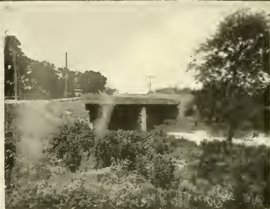
BRIDGE ST. DAVID