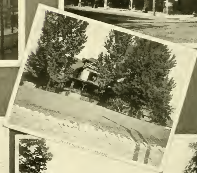
TERRY RESIDENCE JEFFERSON ST