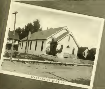
JEFFERSON ST. BAPTIST