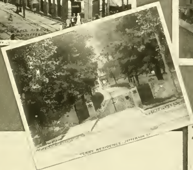
TERRY RESIDENCE JEFFERSON ST