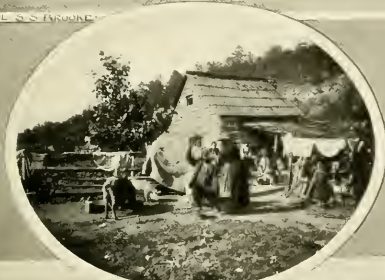
OVER IN BALLYNAK