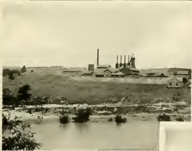
WEST END FURNACE