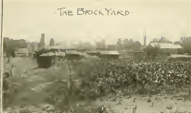
THE BRICK YARD.