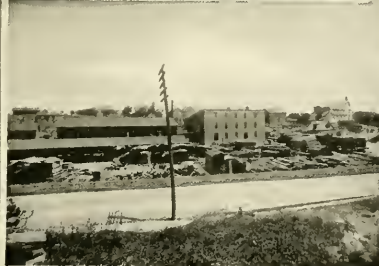
CENTRAL MANUFACTURING CO.