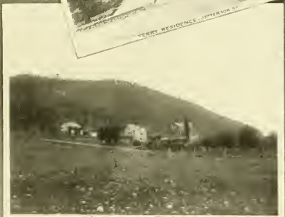
HILL MOUNTAIN VIEW