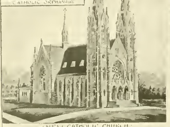
NEW CATHOLIC CHURCH