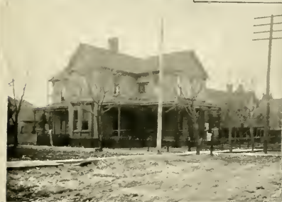
STONE, ROANOKE, VA.