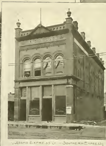
ADAMS EXPRESS CO. - SOUTHERN EXPRESS.