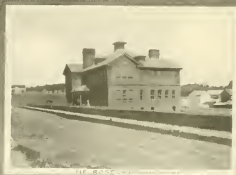
E. C. SCHOOL