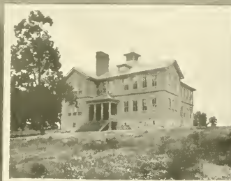
E. A. SCHOOL