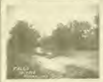
FALLS ON THE ROANOKE