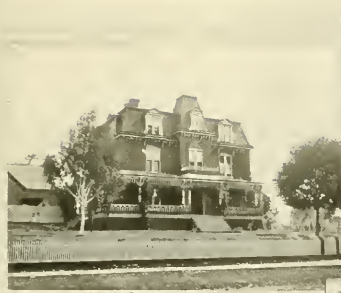
JAS. S. SIMMONS PROJECT