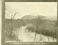
ROANOKE RIVER - WEST END