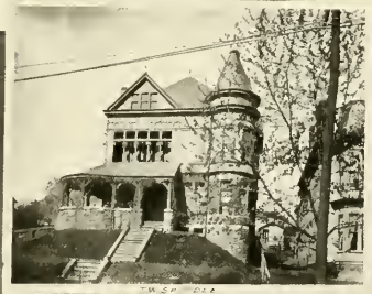
W. S. S.