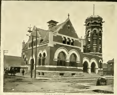
FIRST CHURCH OF CHRIST