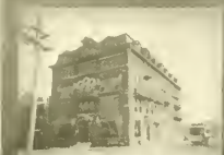
PONCE DE LEON HOTEL