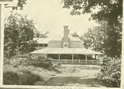
C. H. BENTLEY HOUSE