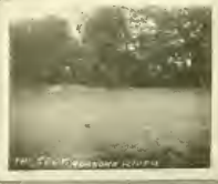
THE TENNY RESIDENCE SITE