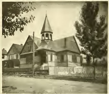
BAPTIST PRESBYTERIAN CHURCH