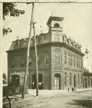
FRIENDSHIP FIRE CO