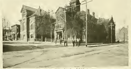
CITY HALL AND JAIL