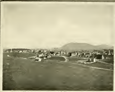
VIEW FROM THE HILL