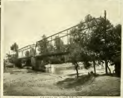
FRANKLIN ROAD BRIDGE