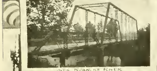
THE RICHMOND BRIDGE