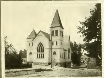
GRACE M.E. CHURCH