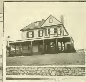
W. W. WELLS