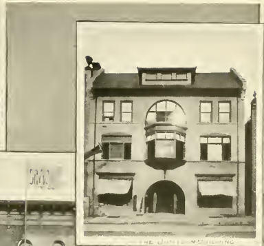
THE UNION BUILDING