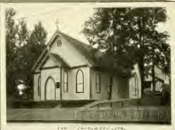
CHRIST CHURCH EPI. LORAL