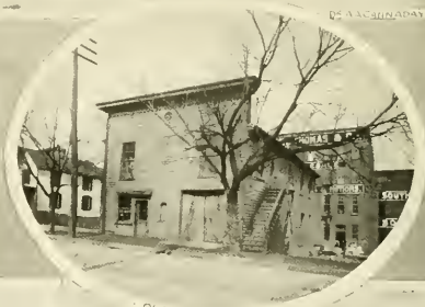
OLD RULER HALL