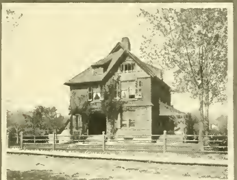
W. B. CROFT