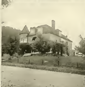
O. HOWARD HOUSE