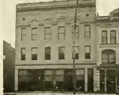
IRON BELT BUILDING