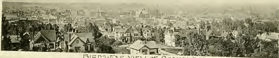
BIRDS-EYE VIEW OF ROANOKE, VA.