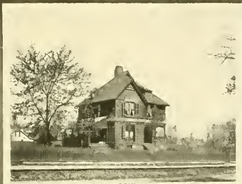
W. B. CROFT