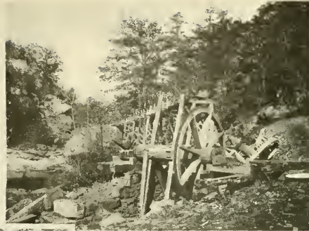
RUINS OF OLD MILL NEAR ROANOKE VA