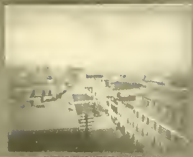
BIRDSEYE VIEW LOOKING WEST FROM THE CORNER OF CAMPELL AND JEFFERSON