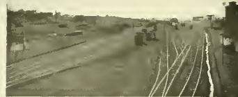
WEST END YARDS