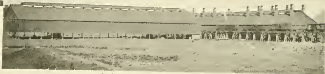
WEST END ROLLING MILL.