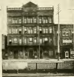
ST. JAMES HOTEL