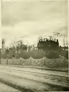
VIEW OF ELWOOD - FIRST DEER'S RESIDENCE