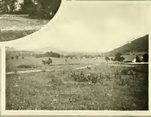
Scenes about Virginia College.