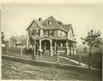
W. W. WELLS