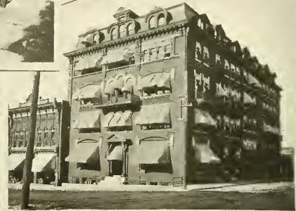
PONCE DE LEON HOTEL