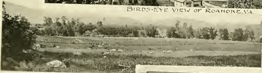
THE GISH FARM