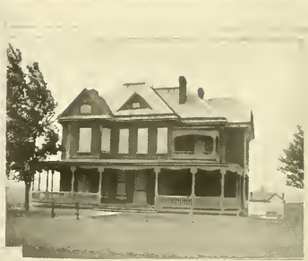
W. H. PETERSON PROJECT