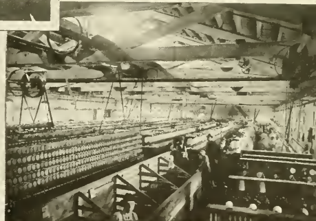
INTERIOR VIEW AT ROANOKE COTTON MILL.