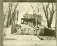
THE TENNY RESIDENCE