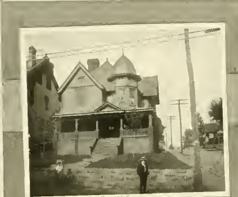
N. T. BROWN