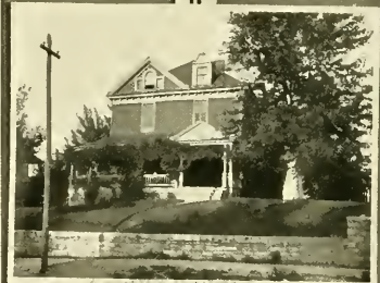
VIEW FROM THE CITY