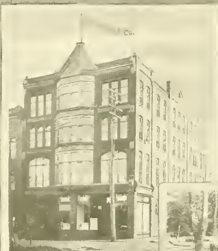
T. O. T. & CO. SALEM AVENUE