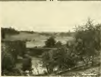
VIEW FROM THE CITY