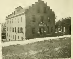
R. H. GARDNER & CO.