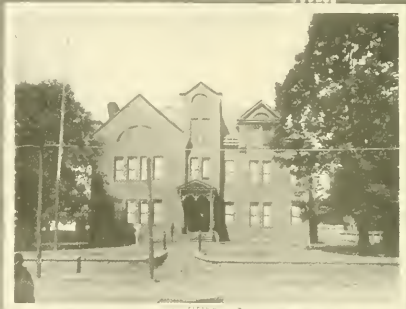
S. P. SCHOOL