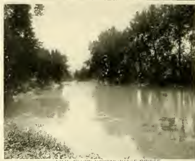
VIEW BELOW HARBAY QUAGS BRIDGE