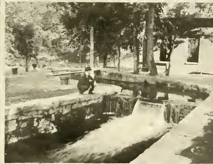
ANOTHER VIEW OF CRYSTAL SPRING