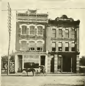
"THE ROANOKE TIMES" OFFICE