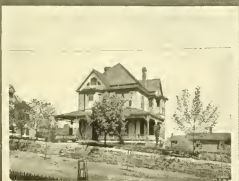
W. B. CROFT