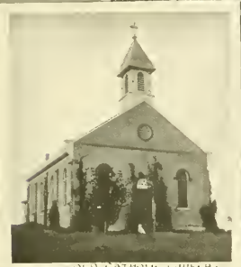
OLD CATHOLIC CHURCH