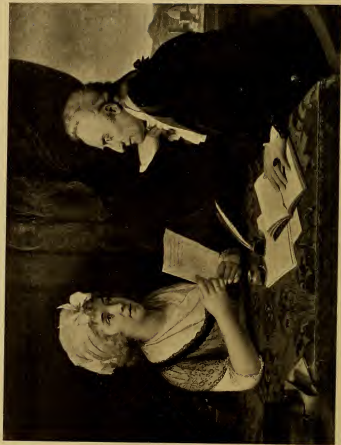
ALFIERI AND THE COUNTESS OF ALBANY From the original portrait in the possession of the Marchese di Trivulzio di Sestriano