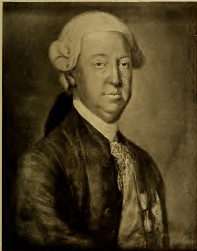
CHARLES EDWARD STUART