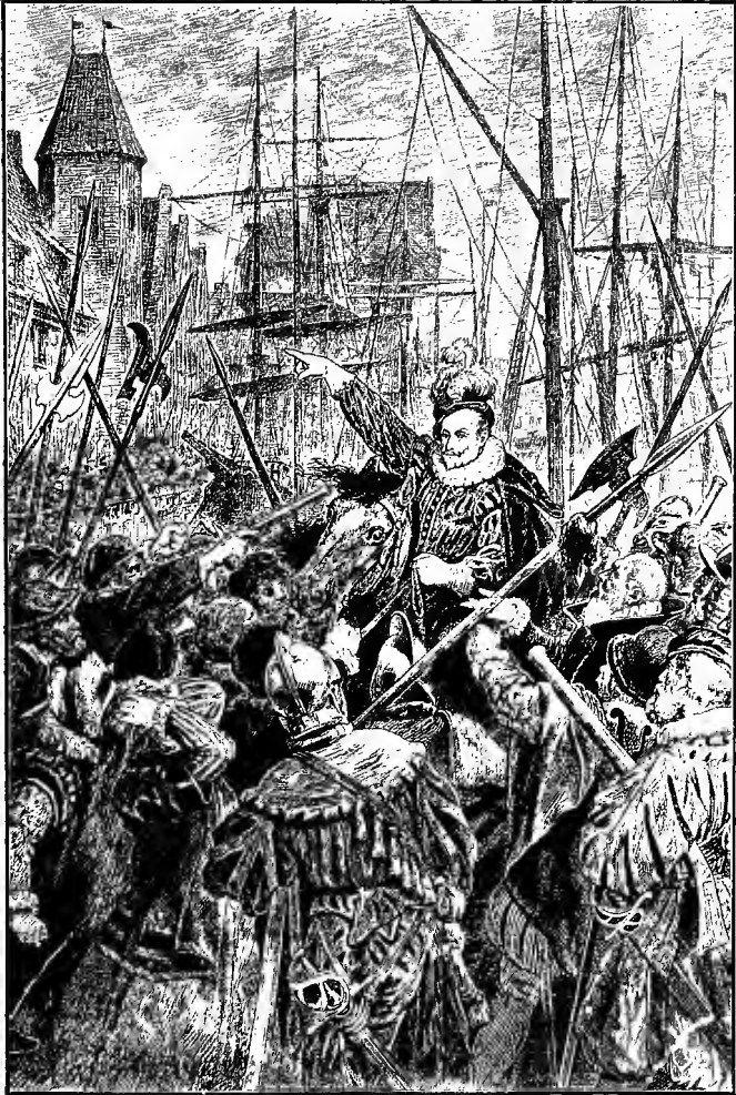
WILLIAM OF ORANGE QUELLS THE RIOT OF THE SECTARIANS WHILE TOULOUSE IS BEING ATTACKED BY LAUNOY