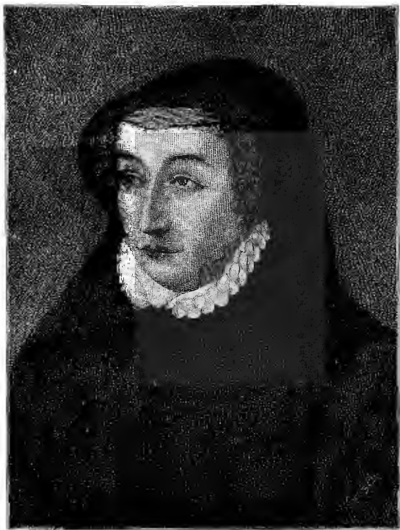
CATHERINE DE MEDICI Painting by François Clouet, Chantilly.