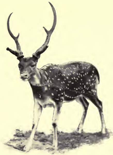
SPOTTED BUCK ( Cervus axis ) A good head, not quite clear of "velvet"