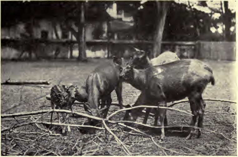
ELK HINDS, A YOUNG BUCK AND A SPOTTED DOE