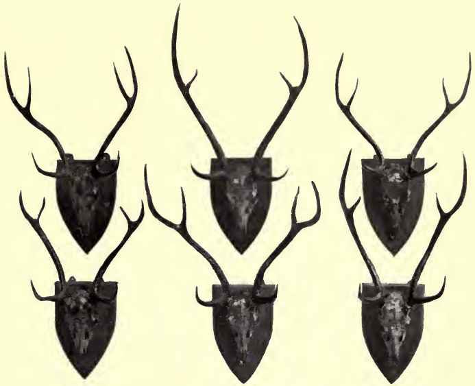
SPOTTED BUCK HEADS, FROM THE AUTHOR'S TROPHIES, SHOT IN THE NORTHERN LOW COUNTRY

Measurements vary from 30 inches down to 24 inches