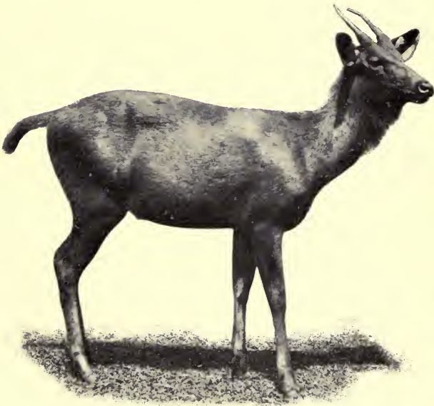
YOUNG ELK "SPIKE" BUCK