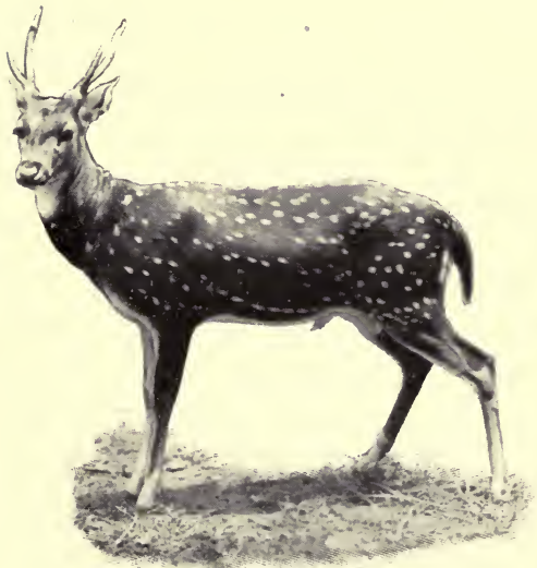
SPOTTED BUCK ( Cervus axis ) Second Year's Horns