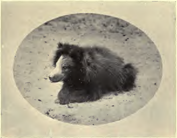
A YOUNG BEAR ( Melursus ursinus )