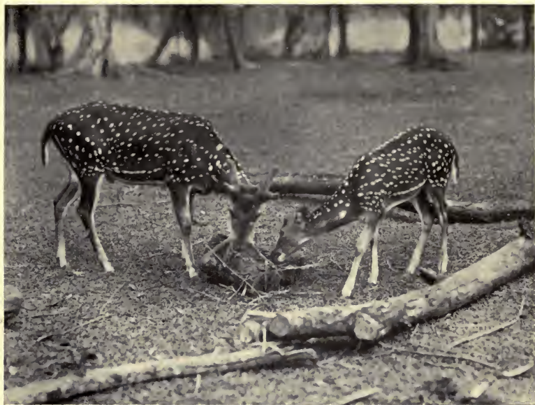
SPOTTED BUCK WITH SPROUTING ANTLERS. SPOTTED DOE