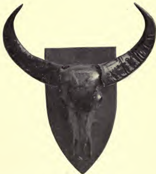
A FAIRLY TYPICAL HEAD OF A CEYLON WILD BUFFALO, SHOT BY THE AUTHOR