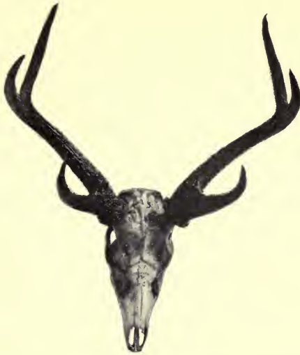
TYPICAL CEYLON ELK HEAD, FROM THE AUTHOR'S TROPHIES Length round curves 24\frac{1}{2} inches, circumference above the burr 8\frac{1}{2} inches