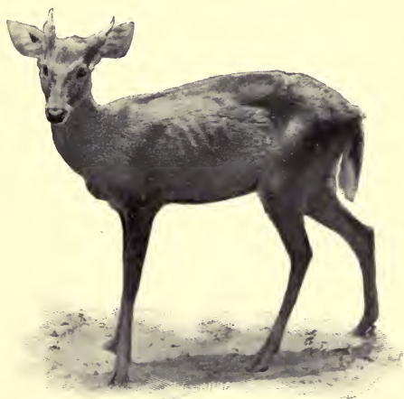
A RED BUCK ( Cervulus muntjac )