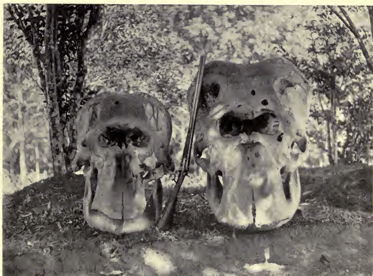
SKULLS OF TWO ELEPHANTS SHOT BY THE AUTHOR