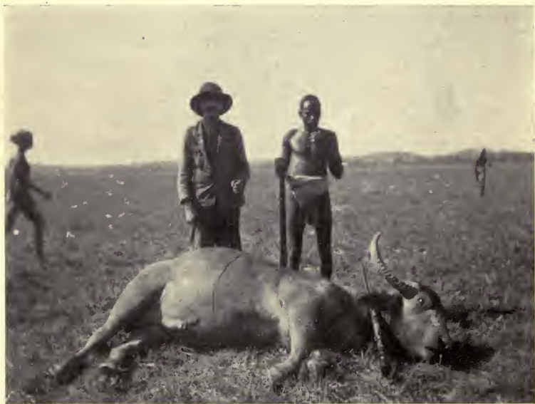
DEATH OF A WILD BUFFALO