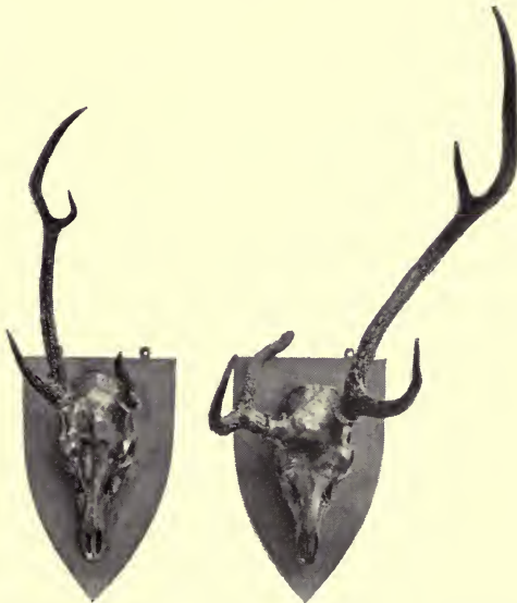
A PAIR OF CURIOUS SPOTTED BUCK MALFORMATIONS, FROM THE AUTHOR'S TROPHIES

Measurements vary from 30 inches down to 24 inches