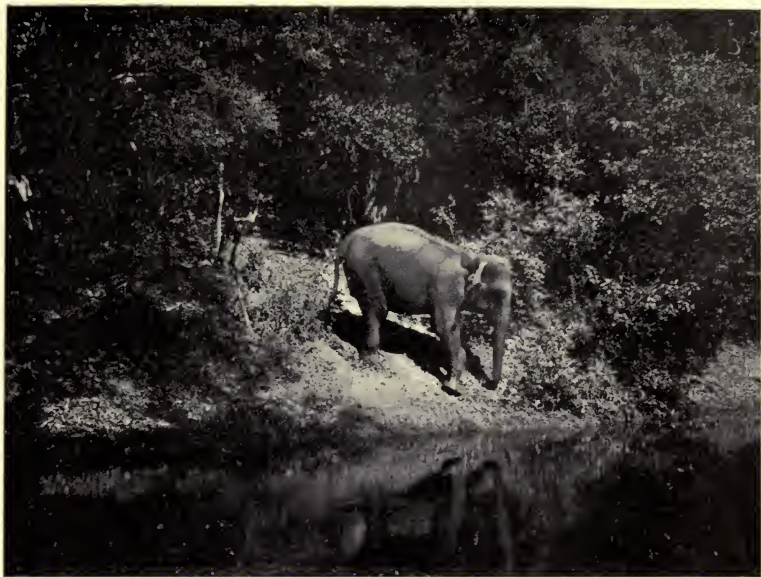
FINE SNAP-SHOT PHOTO BY MR. ALFRED CLARK OF THE FOREST DEPARTMENT