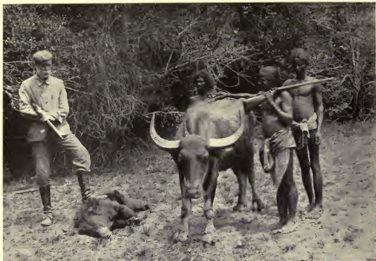
INCIDENT OF A BEAR ATTACKING A "STALKING BUFFALO" PARTY