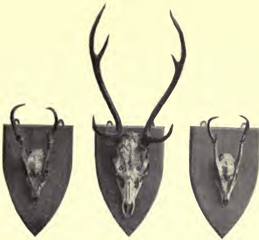
A PAIR OF GOOD RED DEER HEADS AND A SMALL SPOTTED BUCK HEAD, FROM THE AUTHOR'S TROPHIES