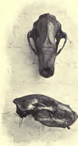
SKULL OF BEAR ( Melursus ursinus )