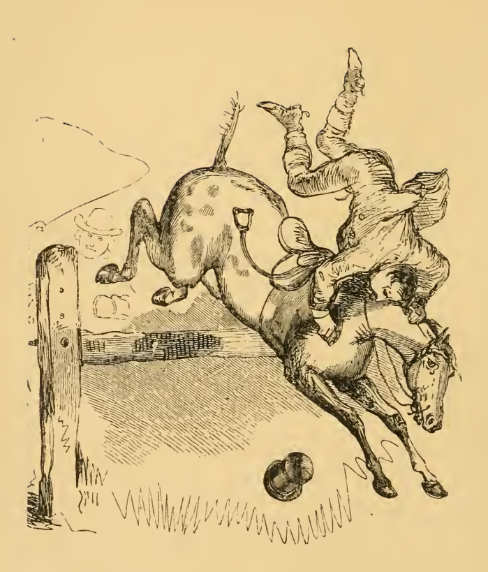
Josh Billings on trotting horses.—See page 63.