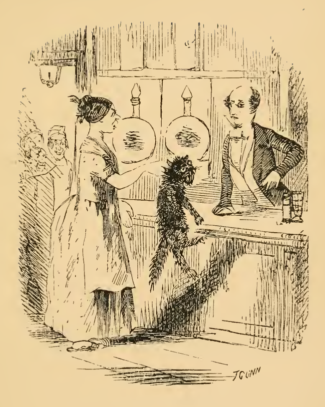
Josh Billings on Cats.—See page 40.