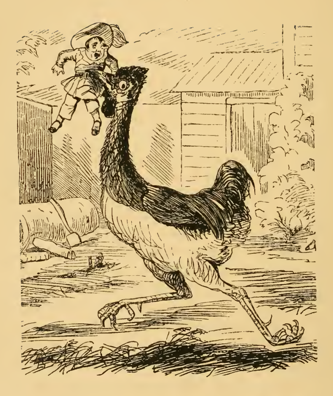
"Not enny Shanghi for me, not enny."-See page 189