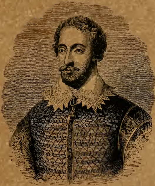
PORTRAIT OF EDMUND SPENSER.