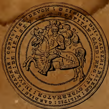
RALEIGH'S SEAL OF OFFICE.

T. NELSON AND SONS, LONDON AND EDINBURGH.