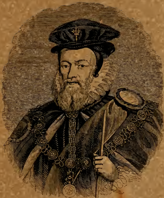
PORTRAIT OF LORD BURLEIGH.