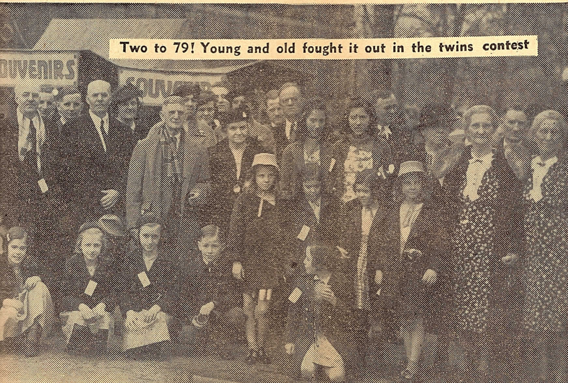
Two to 79! Young and old fought it out in the twins contest