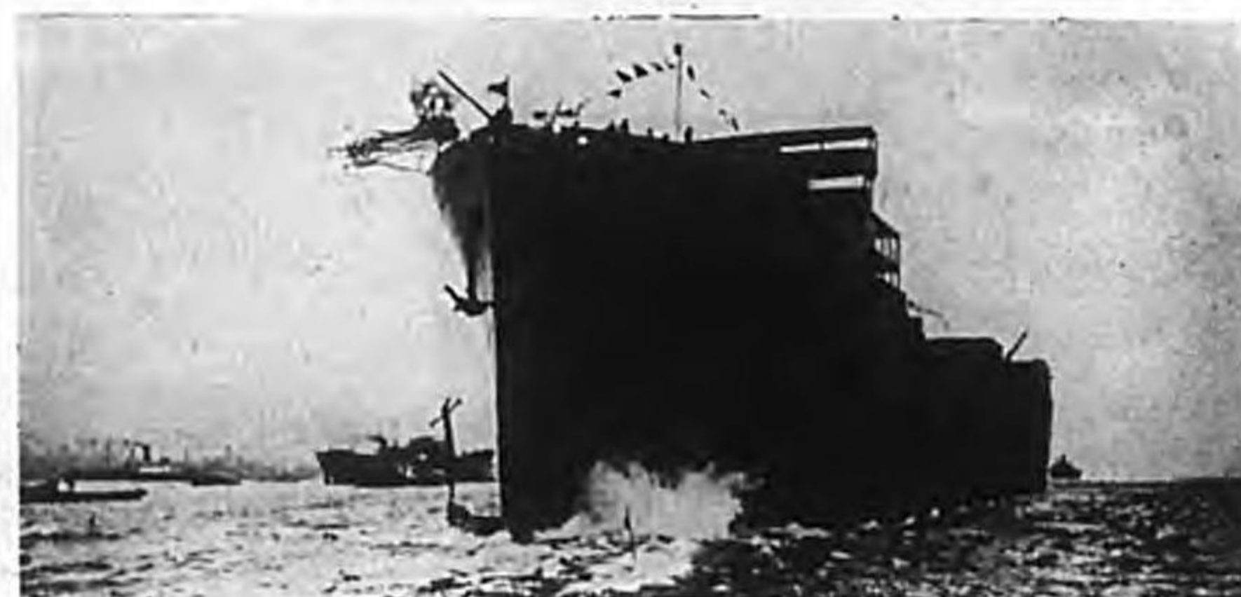
Kyokuyō Maru at the Launch

Head Office: Marunouchi Bldg., Marunouchi, TOKYO