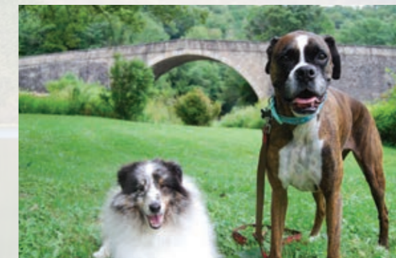
Most areas are leashed dog friendly and pet approved.