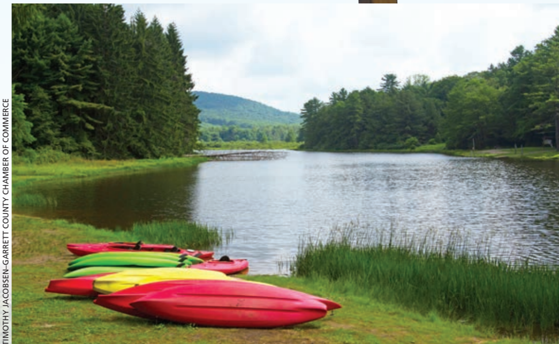
TIMOTHY JACOBSEN-GARRETT COUNTY CHAMBER OF COMMERCE

Deep Creek Lake State Park, includes a challenging network of mountain biking trails and a well-marked trail system includes a hike to a lookout tower with exceptional views of western Maryland. The Discovery Center mixes learning and fun with exhibits on turtles, foxes, black bears and an on-site aviary of rescued and rehabilitated birds of prey.