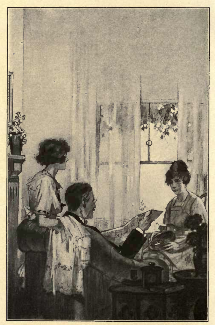
"I do wish I could go, Jess!" His thin pleasant face with its dark eyes took on a hungry expression