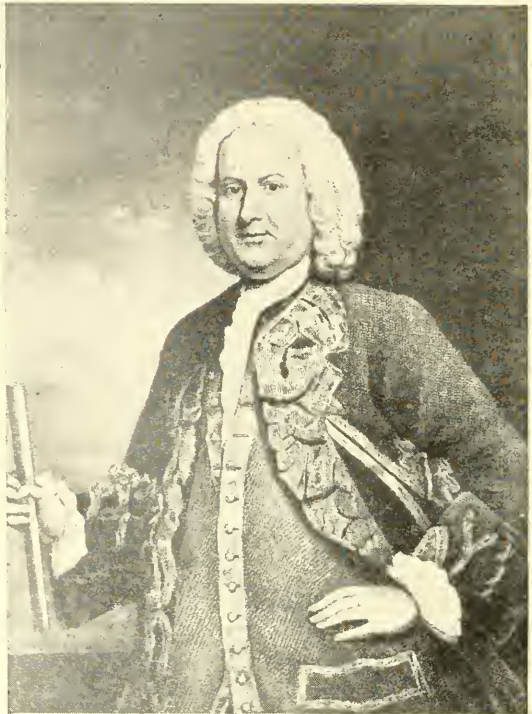
SIR WILLIAM PEPPERELL

William Pepperell is a prominent figure in the colonial history of Maine. He was born at Kittery Point, Maine, June 27, 1696, and died there July 6, 1759. He was first a merchant but later entered politics and in 1727 was elected one of His Majesty's Council for the province of Massachusetts, and was regularly re-elected for 32 years in succession. He was commander of the troops at Louisburg in 1745, and for his bravery and military ability was made a baronet by the British government.