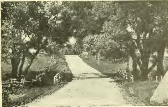
The Rubicon or the "O'Brien Brook."