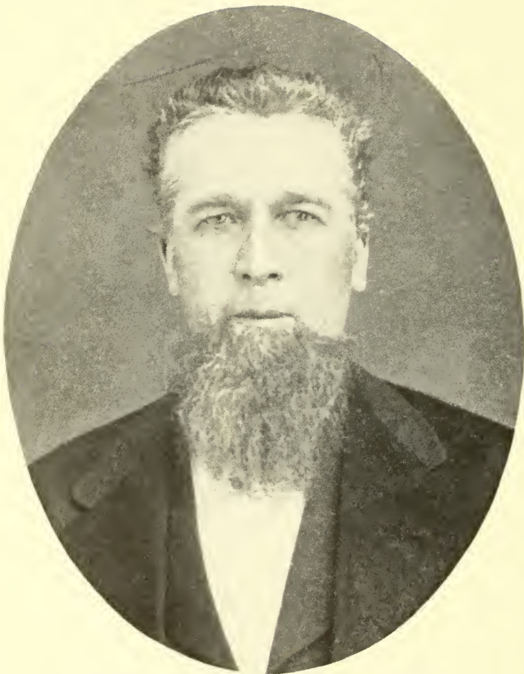
HONORABLE AUGUSTUS GARDNER LEBROKE