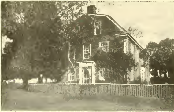
The former home of Sir William Pepperell, now standing in the town of Kittery, Maine