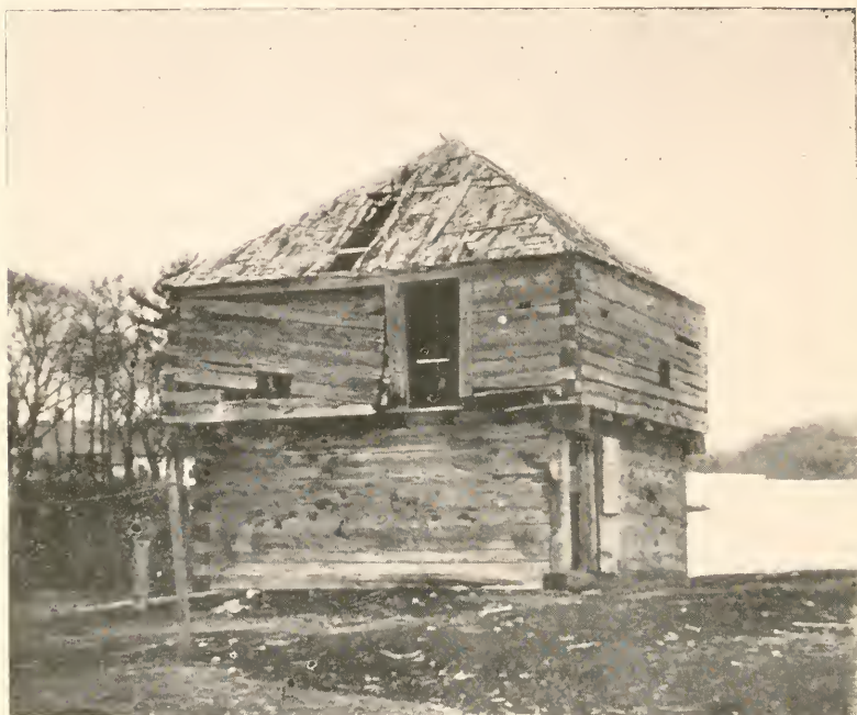
A Colonial landmark now standing in Central Maine, being situated within the town of Winslow in Kennebec County. In 1754 Governor Shirley erected quite an extensive fortification there which would accommodate four hundred men. It was situated at the junction of the Kennebec and Sebasticook Rivers, near Ticonic Falls. The above represents one of the block houses of this fortification on the same spot where it was originally built and is now known as "Fort Halifax."