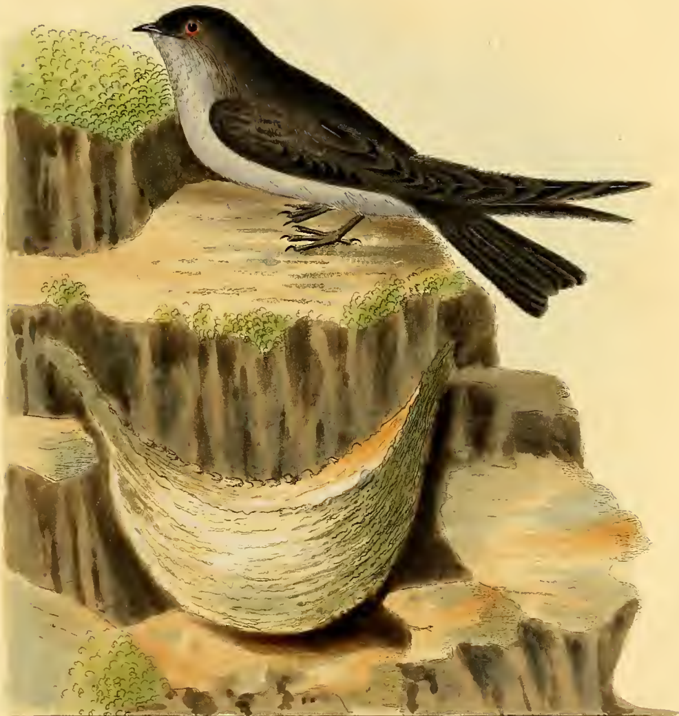
Esulent Swallow with the Nest.