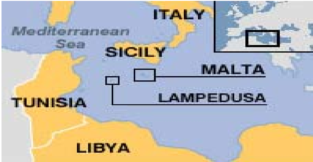
Figure 2. Italy-Libya area of tensions (From Jesuit Rescue Service/USA, http://www.jrsusa.org/images/lampedusa_map.jpg )