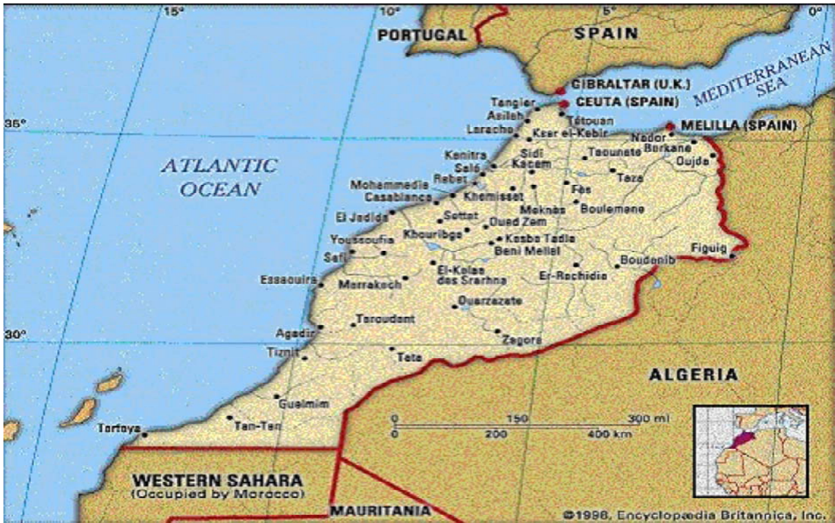
Figure 1. Spain-Morocco Area of Tensions 92