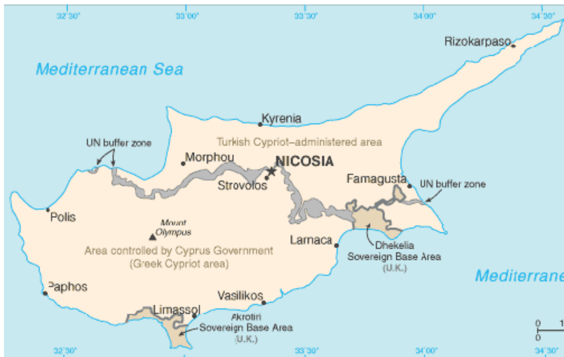
Figure 4. Cyprus Area of Tensions