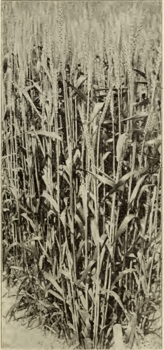
"BEARDLESS" RURAL NEW YORKER WHEAT.

Price, $3.00 per bushel of 60 lbs.; 10-bushel lots, $2.90 per bushel.