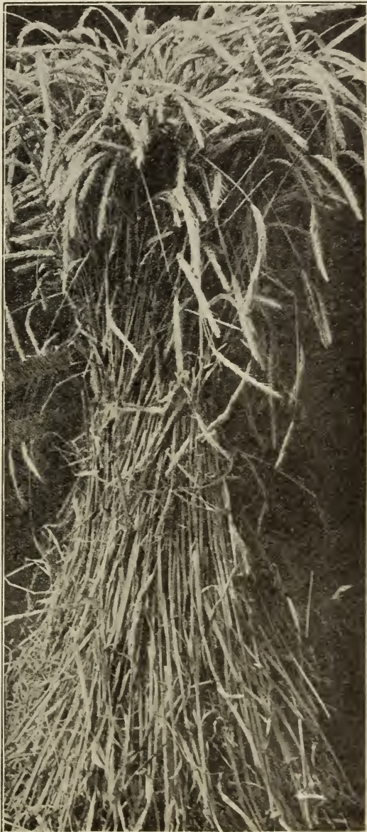
THE NEW ROSEN RYE

Price, $2.25 per bushel of 56 lbs.; 10-bushel lots, $2.15 per bushel.