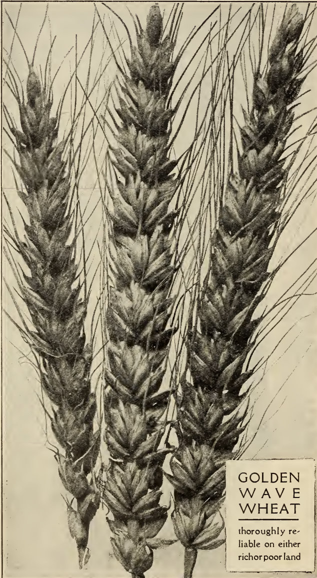
GOLDEN WAVE WHEAT

Due to its thick-walled stem and extra stiffness this variety resists rust and fly better than most others, and produces uniformly good crops, yields of more than forty bushels per acre are not at all uncommon. The heads are of great length, for a bearded variety, and often contain as many as fifty-eight grains. The berry is plump, red in color, quite large, and the chaff is amber-brown. Sow 1\frac{3}{4} bushels per acre. Price, $3.00 per bushel of 60 lbs.; 10-bushel lots, $2.90 per bushel.