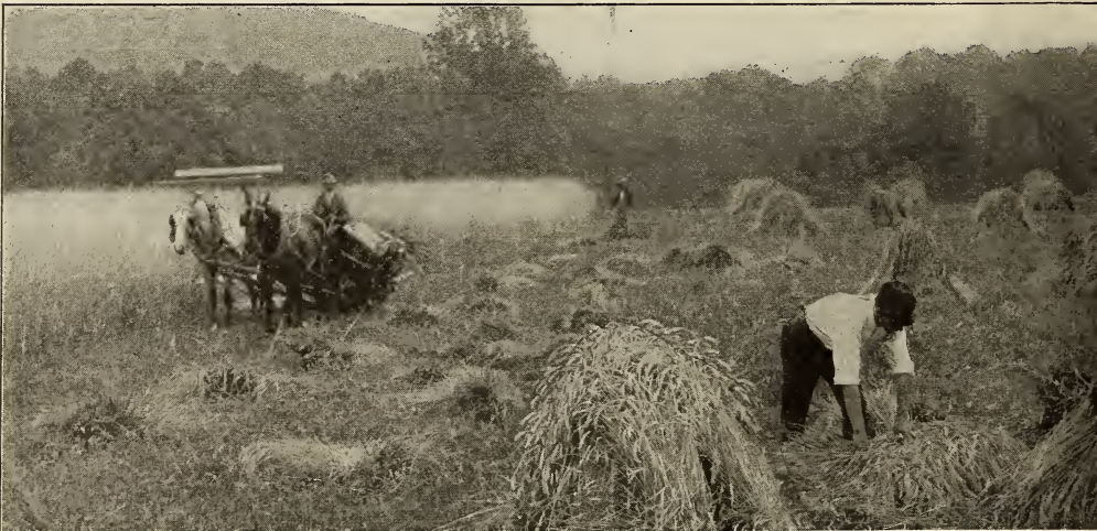
LEAP'S PROLIFIC WHEAT

Price, $3.25 per bushel of 60 lbs.; 10-bushel lots, $3.15 per bushel.