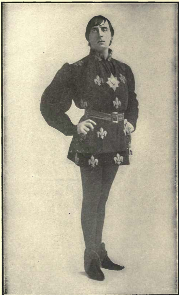
"I am François Villon and yet no longer he, for my old evil self