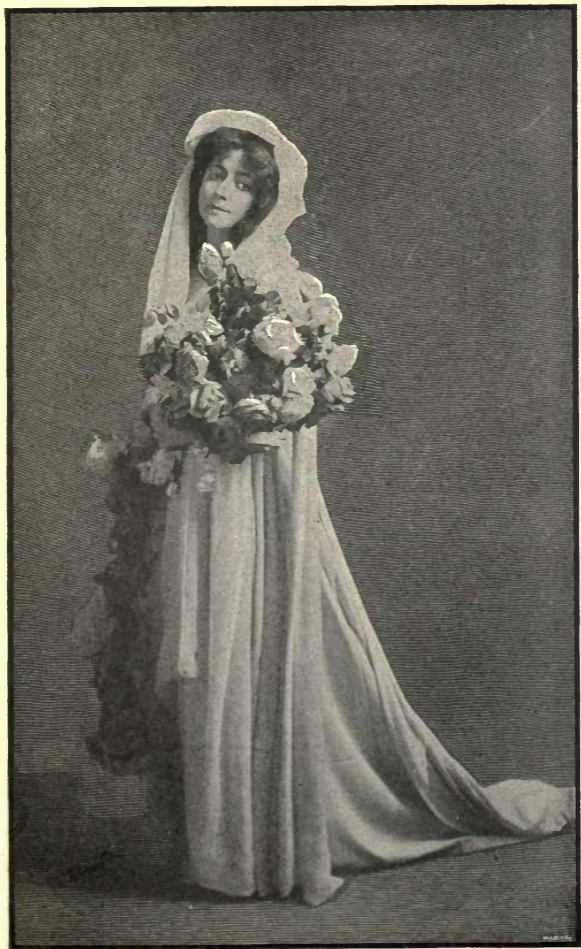
"To her Majesty, sire, who bade me gather roses."