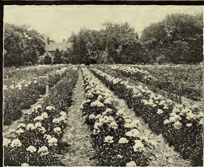
A BLOCK OF PEONIES IN OUR NURSERY