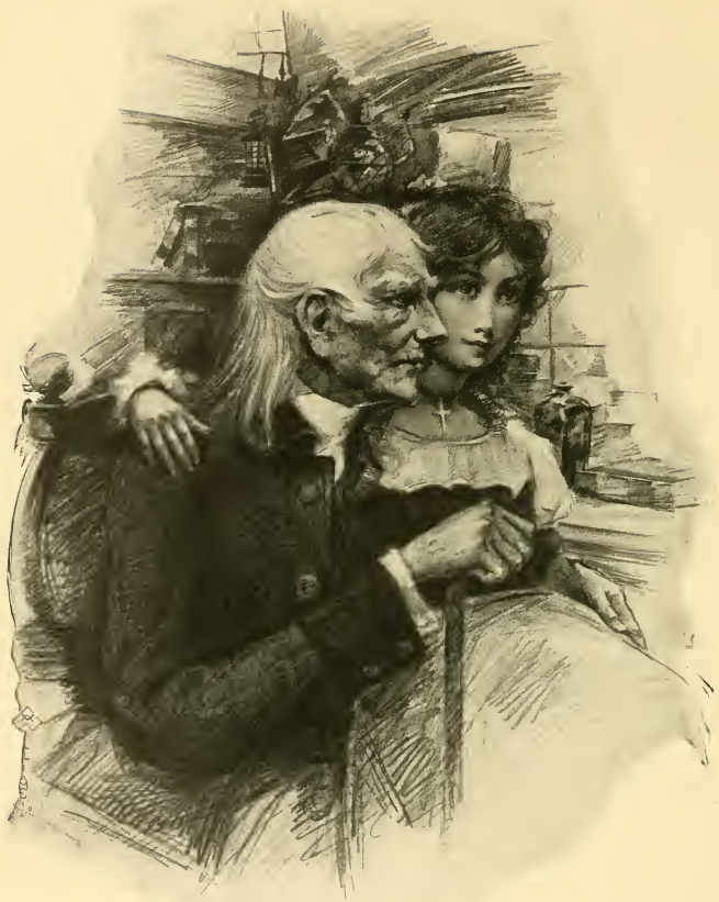
LITTLE NELL AND HER GRANDFATHER.