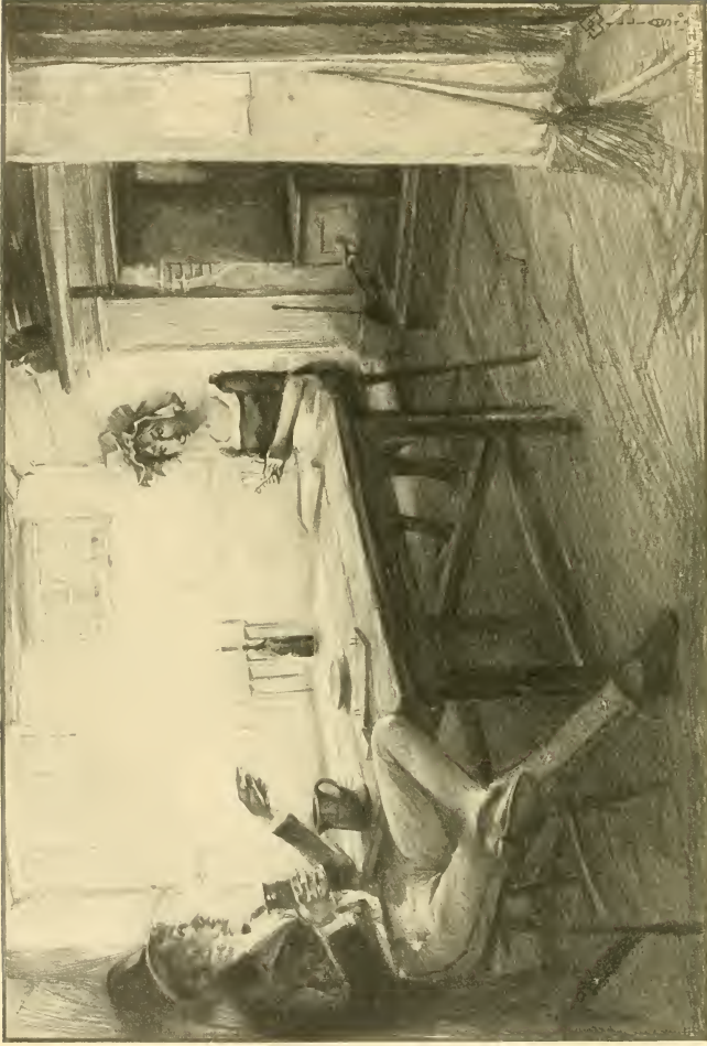
THE MARCHIONESS AND DICK SWIVELLER.