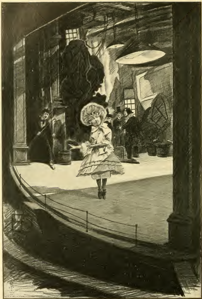
THE INFANT PHENOMENON.