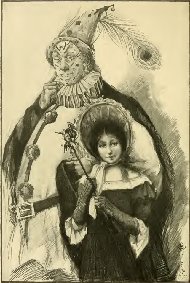
SISSY JUPE AND HER FATHER.