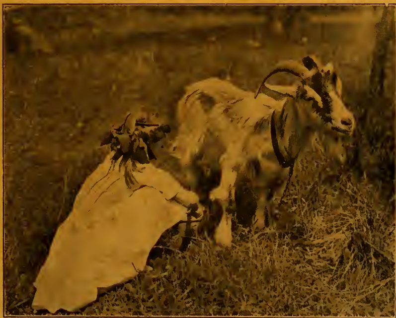
THE LITTLE DAIRYMAID.

The Standard Milch Goat Breeders' Club of North America