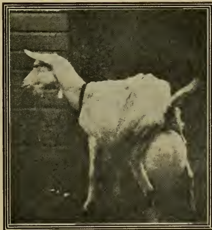
Imported Saanen Goat gave 1,845 lbs. milk in 10 months' test at N. Y. Agri. Exp. Station.