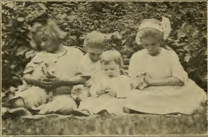
The Goats Milk Juveniles of "Jagerhof."

The lad and lassies that have been raised on goats milk, who tend the goats, milk them and enjoy their products, rich milk free from germs, and "roasted kid," the dish of kings.