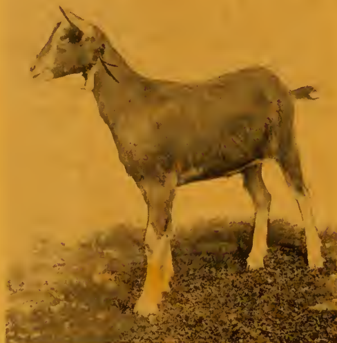
"Howie," No. 624, First Prize and Champion Doe

"Chieftain Jr." No. 590 } Chieftain, No. 281. Imported. Faun, No. 115. Imported.