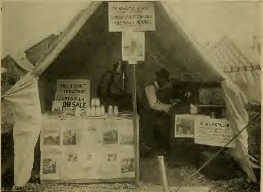
Information and Secretary's Office, Milch Goat Show, Rochester, N. Y. Goats' Milk sold from this Tent for eighty cents per quart, and the supply was constantly short of the demand.