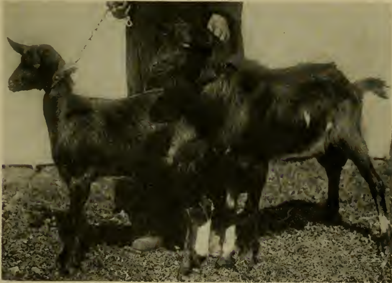
Nuburg, the new Composite Milch Goat Breed. Both buck and doe show the lopping of the ears from their descent from the Anglo-Nubian.

The Western New York Milch Goat Breeders' Association, embracing the seventeen counties in Western New York, that was formed, aimed