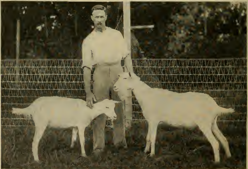
First prize Saanen buck and doe, imported from Switzerland by Mrs. A. W. Lee, of Toledo, Ohio. This buck was called perfection in color and coat—a typical standard Saanen.

In the days of Hippocrates the milk cure was ordered to be taught in the medical schools as a curative of almost all breast affections and consumption.—C. F. Reuss.