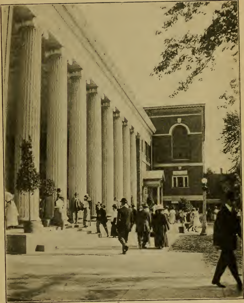
ENTRANCE TO ROCHESTER EXHIBITION PARK.