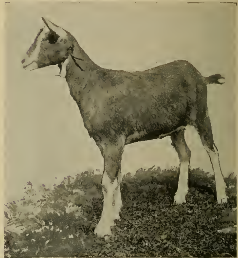
Champion Toggenburg Doe, shown by Dr. R. Schmidt, valued at $500. A perfect specimen at time of show, eight months old.