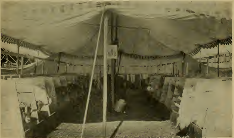
View of Interior of the "Overflow" Tent.

In those countries where the goat is domesticated and its milk is used in the family there is very little tuberculosis.—Dr. O. G. Place.