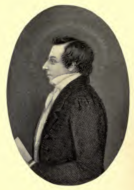
JOSEPH SMITH, JUNIOR From the official portrait in Salt Lake City