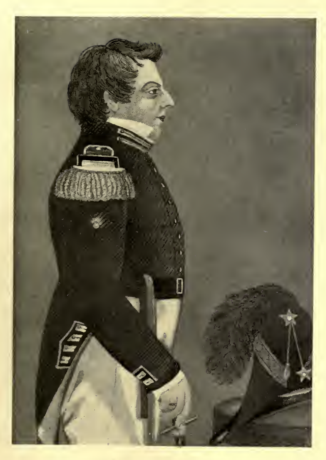
GENERAL JOSEPH SMITH Commander of the Nauvoo Legion