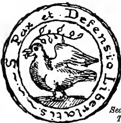
Seal of the Magistrates of the Ten of Liberty and Peace.

From the Florentine Palace on the day and date above written.