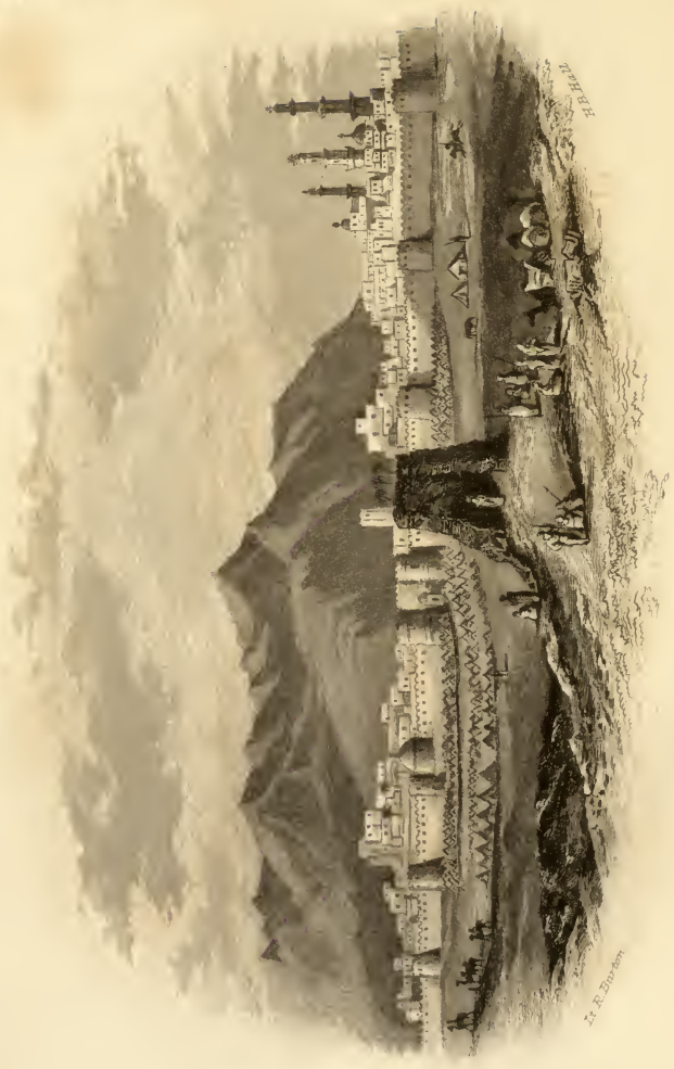
VIEW OF EL MEDINAH, THE PROPHEETS BIRTH-PLACE