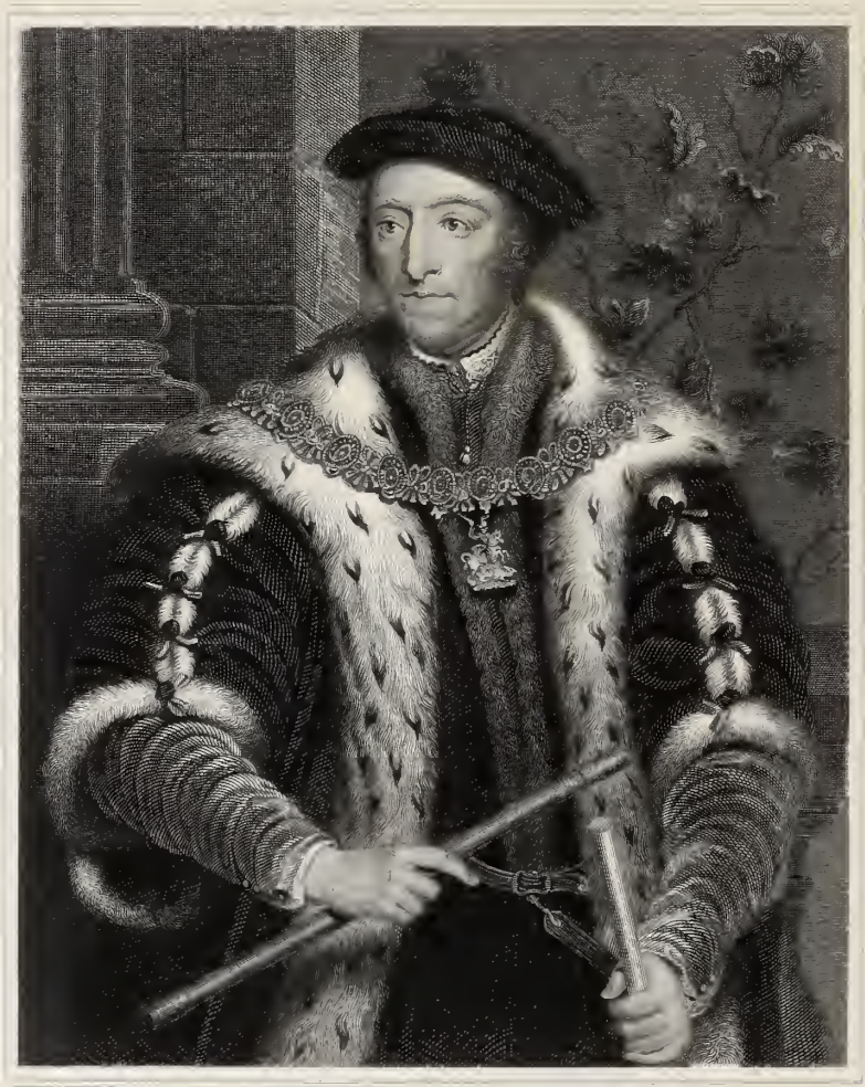
THOMAS HOWARD, DUKE OF NORFOLK.