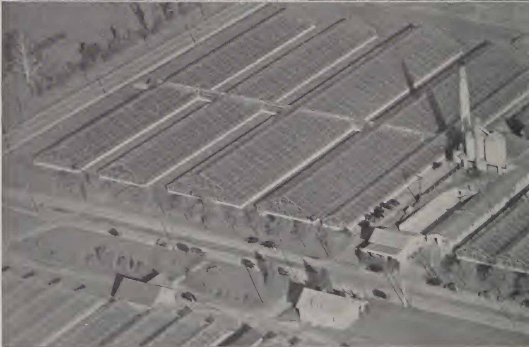
Top: The E. G. Hill Company Range, Easthaven Avenue