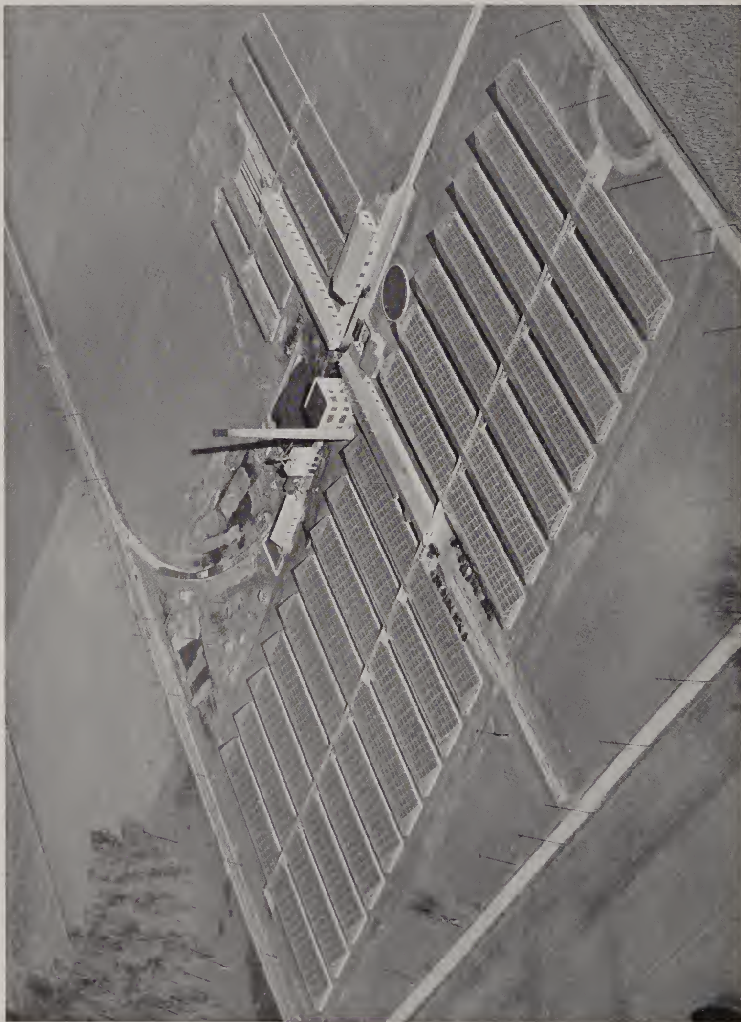
West Range — Joseph H. Hill Co. — Plant B