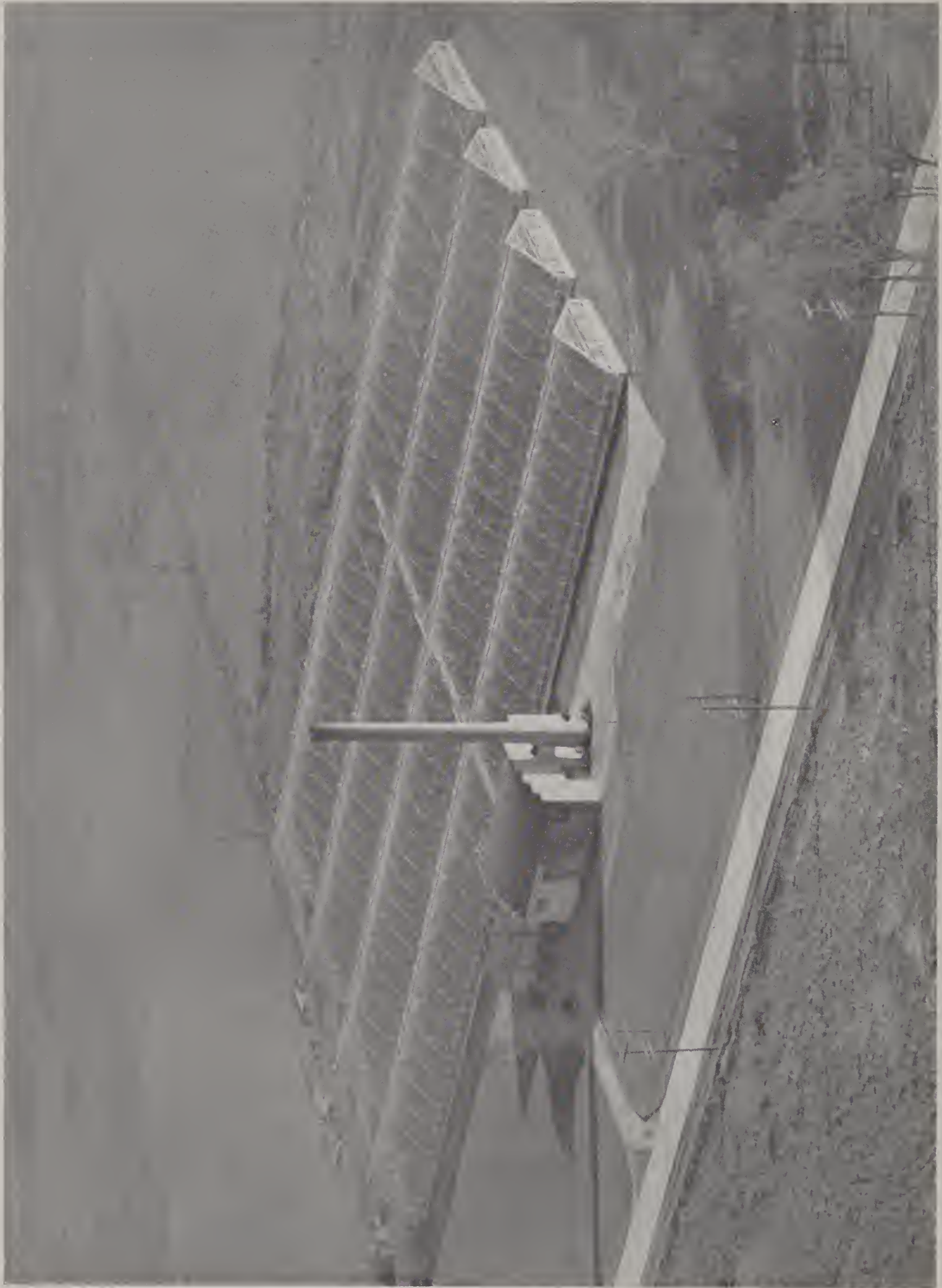
The Joseph H. Hill Company, Plant R, South side of Commons Road