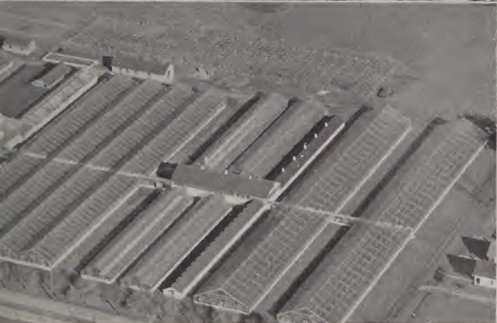
Bottom: The Joseph H. Hill Company, Plant A, Easthaven Avenue