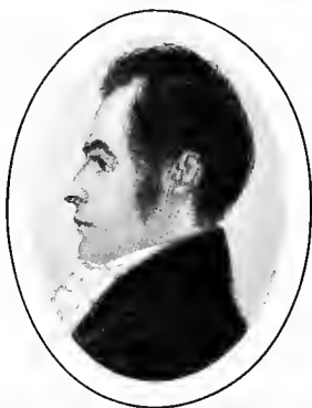
JOHN GREENLEAF WHITTIER