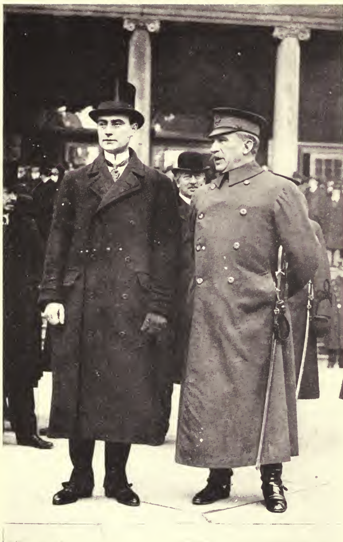
Mayor Mitchel and General Wood reviewing parade of the Alaska soldiers at New York City Hall