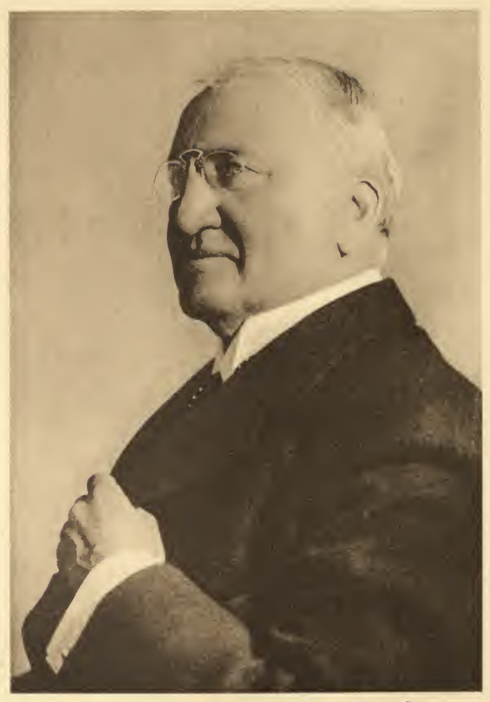
There are no "schools" in art a librature, only found som un turns and artists; shere are no types, only individuals. As Every James Klaubber