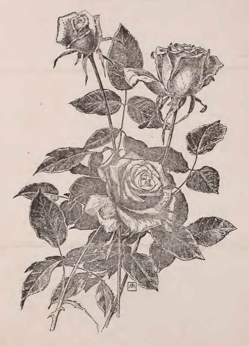
The Most Beautiful Rose of the Year.