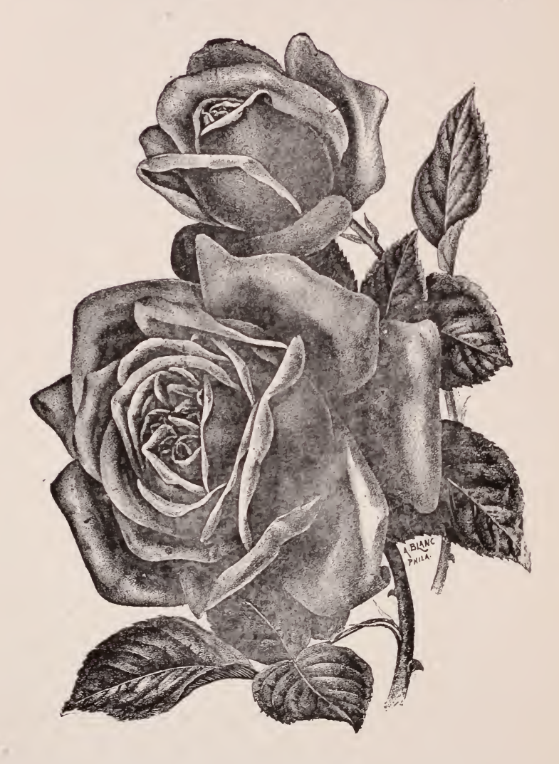
This magnificent New Hybrid Tea Rose is undoubtedly one of the finest of recent introductions.