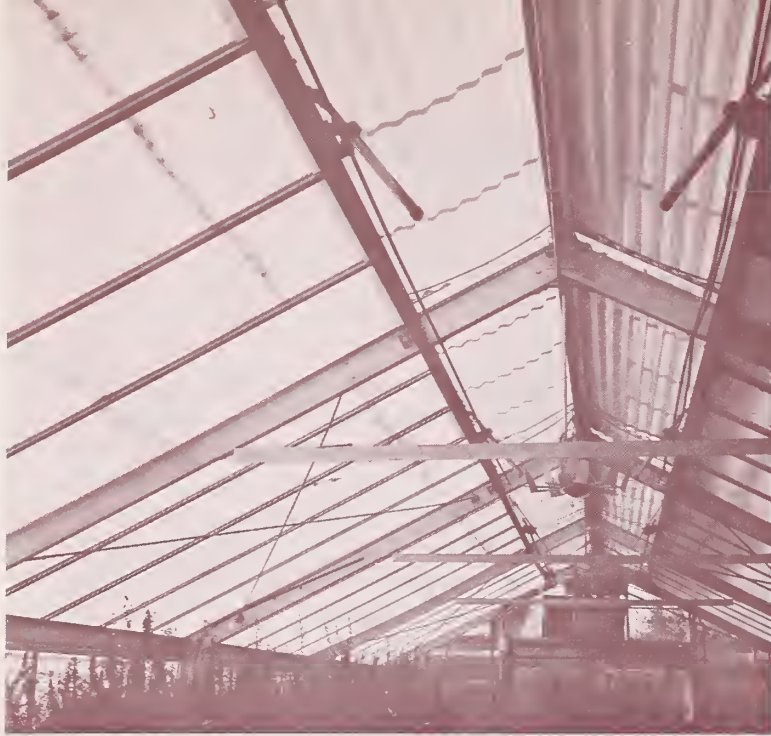
Figure 1.—Types of shading evaluated:

Fiberglass panels installed inside the greenhouse between the rafters.