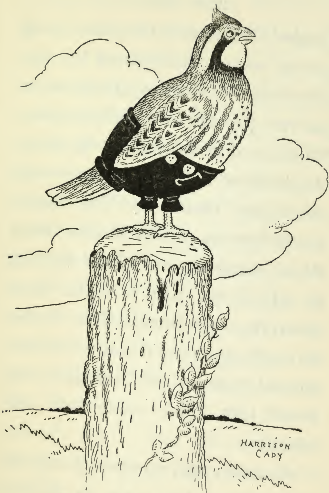
Bob tingled with the joy of living