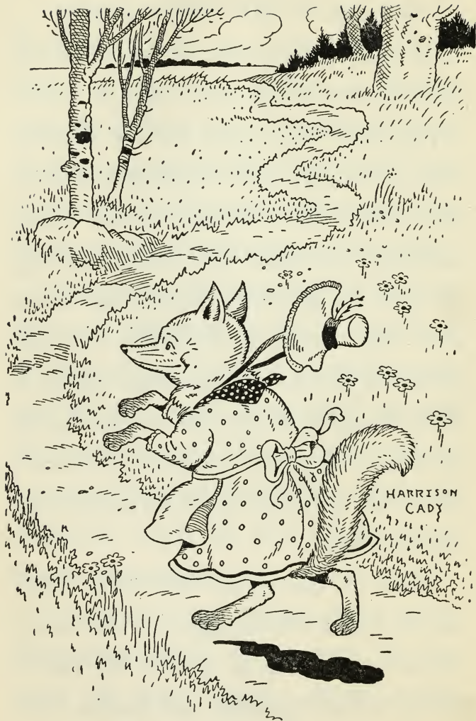
He saw Granny Fox trot down the Crooked Little Path