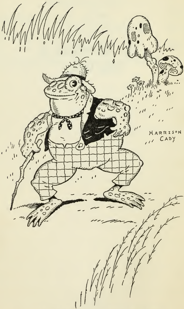
He has become fond of Old Mr. Toad