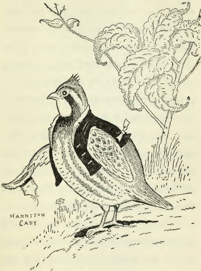
Bob was very neighborly