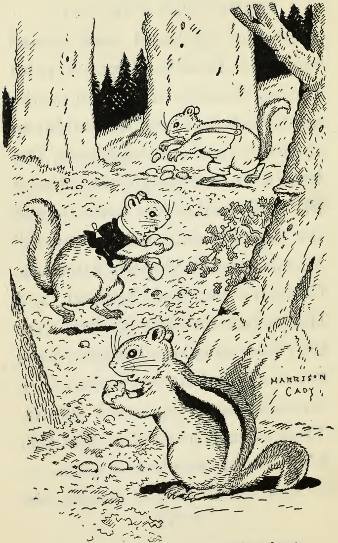
They were busy storing away seeds and nuts