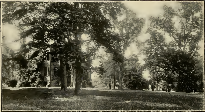
OLD NUTLEY MANOR