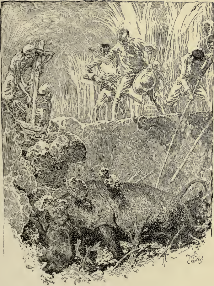
"We began to prod the rhinoceros. . . . He put his head against the wall and rooted; the wall toppled over and he lurched out of the pit and into the cage."