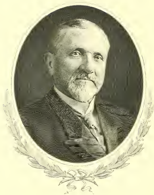
SEN. JOSEPH A. SOULLEN