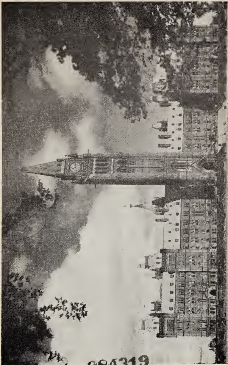
HOUSE OF PARLIAMENT, OTTAWA, ONT.