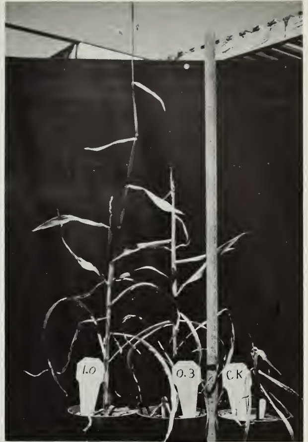
Figure 3.—Corn plants grown in mine spoil material showing effects of 1.0, 0.3, and 0 g/pot of a 0-46-0 phosphorus fertilizer.

The failure of G. fasciculatus to enhance the growth of fourwing saltbush apparently resulted from the inability of the fungus to infect the roots