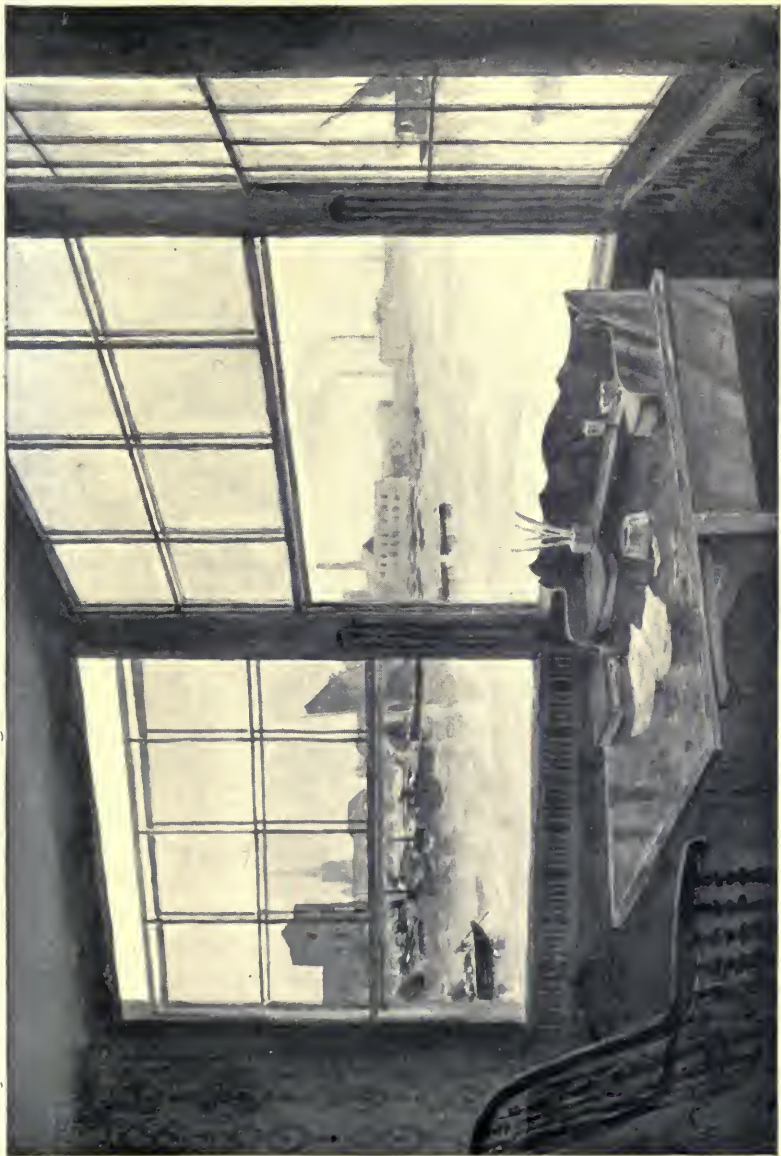
THE DESK IN THE LIMEHOUSE WINDOW WHERE CHARLES DICKENS MADE HIS RIVER-SIDE NOTES FOR "OUR MUTUAL FRIEND."