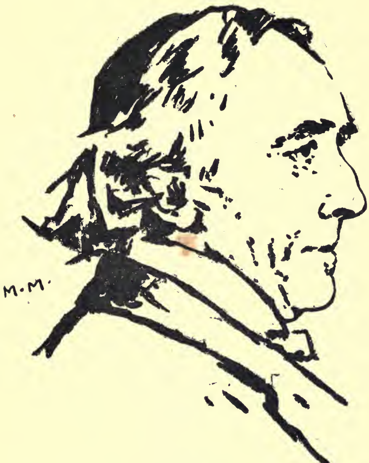
SIR HENRY IRVING.