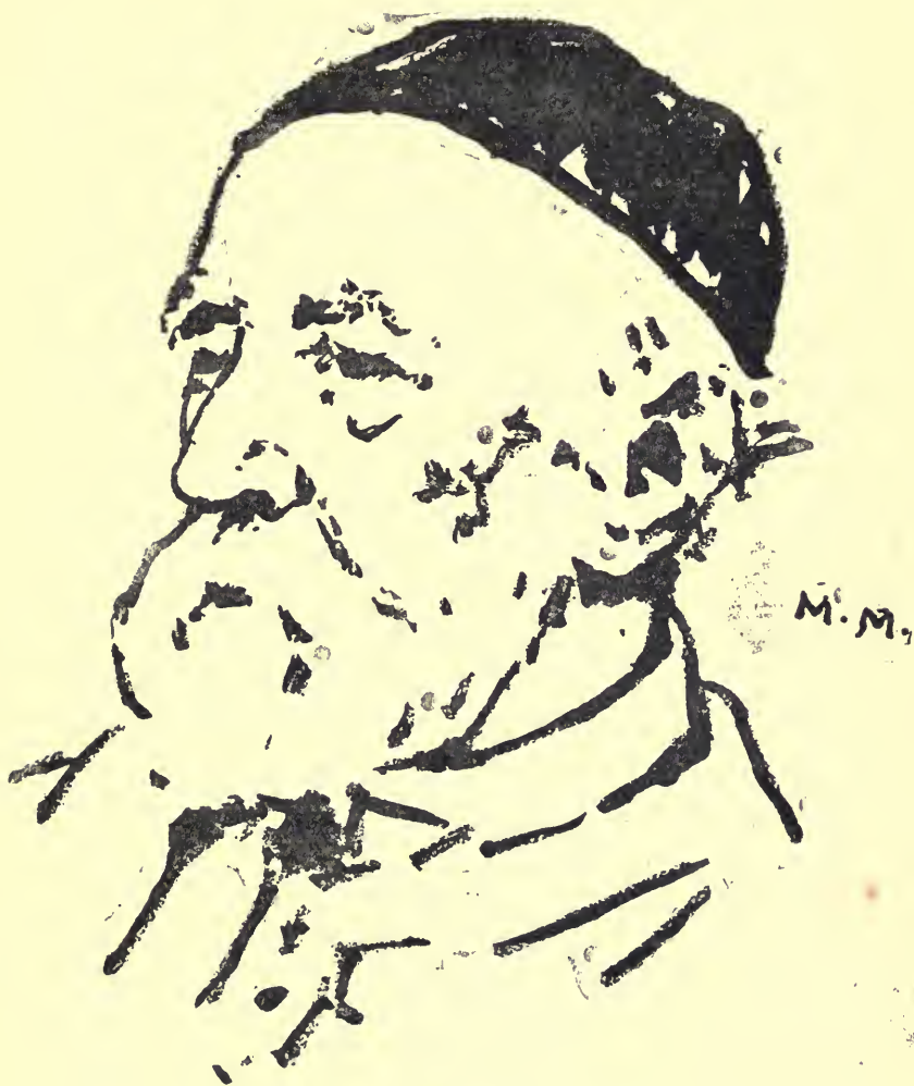
G. F. WATTS.