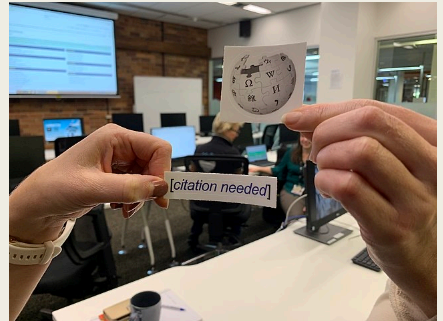
1Lib1Ref stickers.jpg