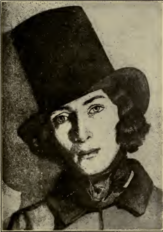
George Sand En costume masculin