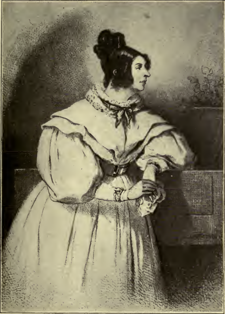
La Duchesse d' Abrantès From a photo-engraving of a rare print