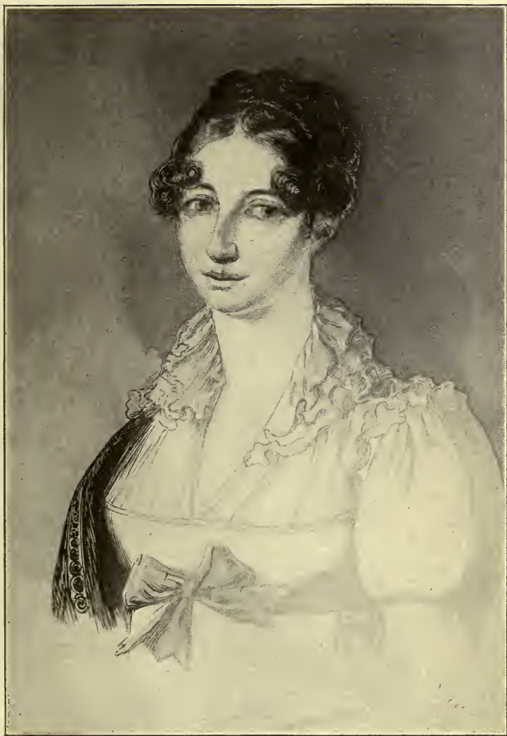
Mme. de Berny