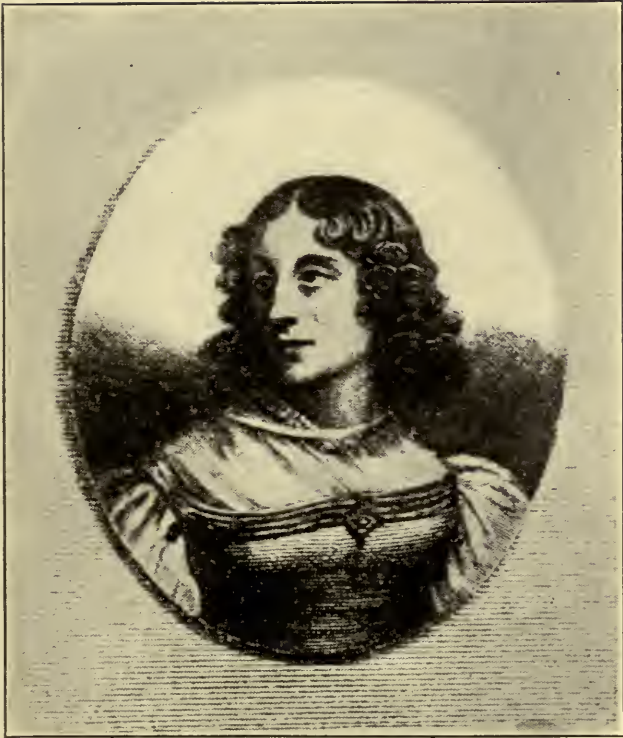
Mme. Desbordes Valmore