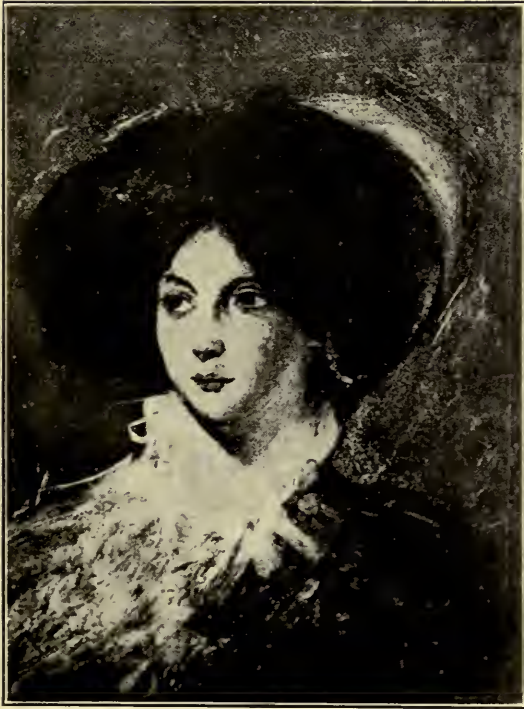
George Sand From a portrait by Delacroix