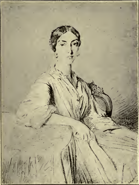
La Princesse Belgiojoso