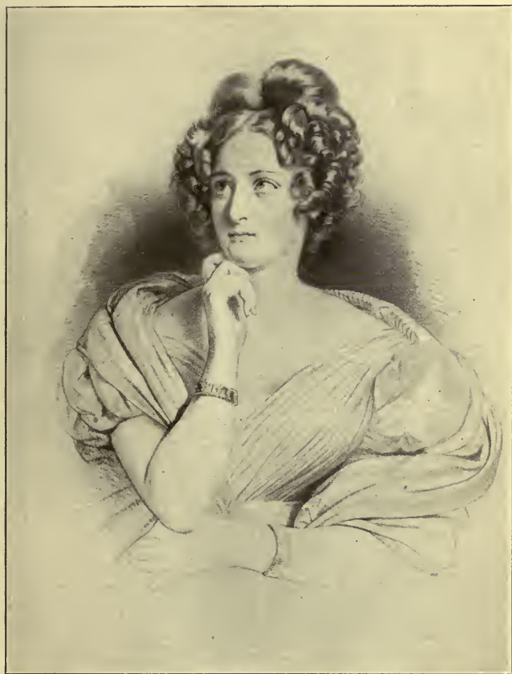
Mme. Emile de Girardin (Mlle. Delphine Gay)