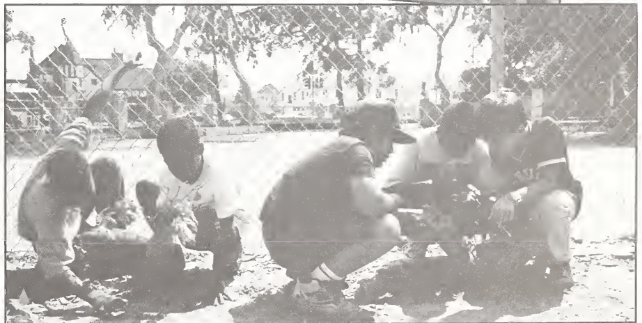
Looking for signs of new growth on our grape plants.