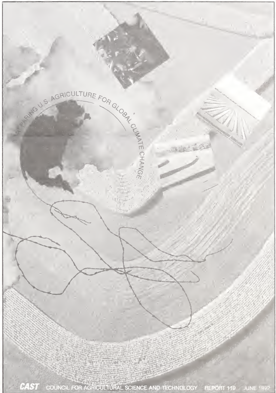
A new task force report details the impact of global warming on agriculture.

Copies of the report are $15 from CAST, 137 Lynne Avenue, Ames, Iowa 50010-7197.