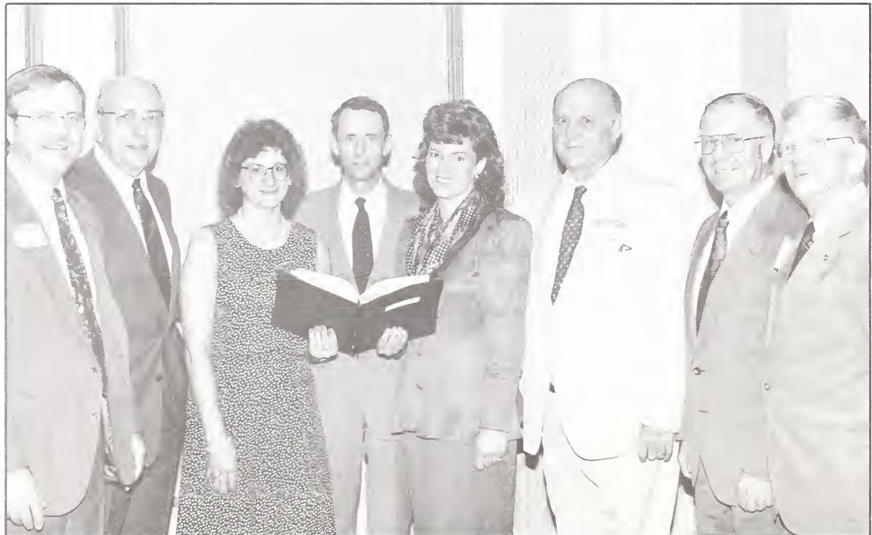
Pennsylvania's Secretary of Agriculture was an honored guest at the summer agriculture institute sponsored by Ag in the Classroom.