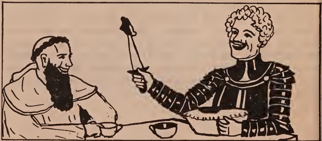
Find the chapters these cartoons illustrate.