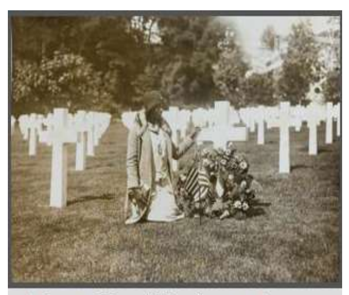
A pilgrim of Party "L" at Suresnes American Cemetery, Suresnes, France-July 26, 1930. National Archives, College Park

management was later transferred to the new American Battle Monuments Commission. To this day these cemeteries are beautifully maintained by the American government.