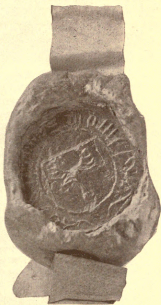
No. 1812. THOMAS EWYNESONE, A.D. 1539.