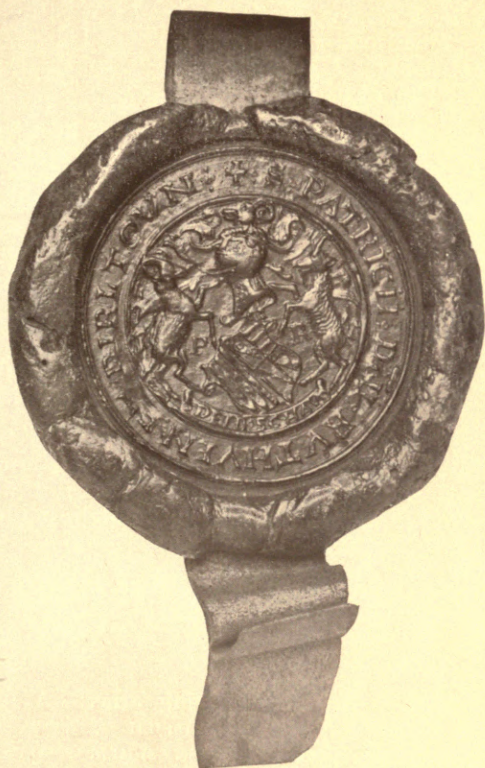
No. 2354. PATRICK, THIRD LORD RUTHVEN, A.D. 1561.