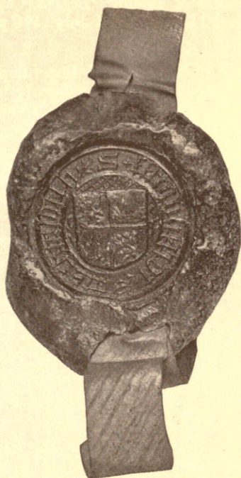
No. 1824. FARQUHAR MACKINTOSH OF KEPPOCH, A.D. 1505.