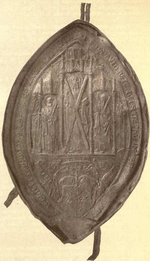
No. 139. CARDINAL DAVID BEATON, A.D. 1545.