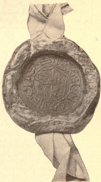
No. 1828. JAMES MACKINTOSH, A.D. 1568.