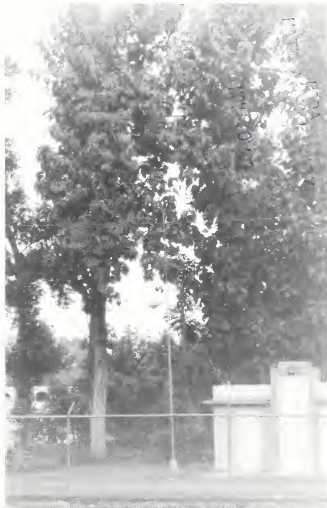
Figure 1.—Plantation teak ( Tectona grandis L. f.) at Sabana in Puerto Rico's Luquillo Forest 2 years after Hurricane Hugo.

Teak was introduced to Puerto Rico from Trinidad more than 50 years ago. Today, about 130 ha of teak are planted on several sites in Puerto Rico and the U.S. Virgin Islands (135, 136).