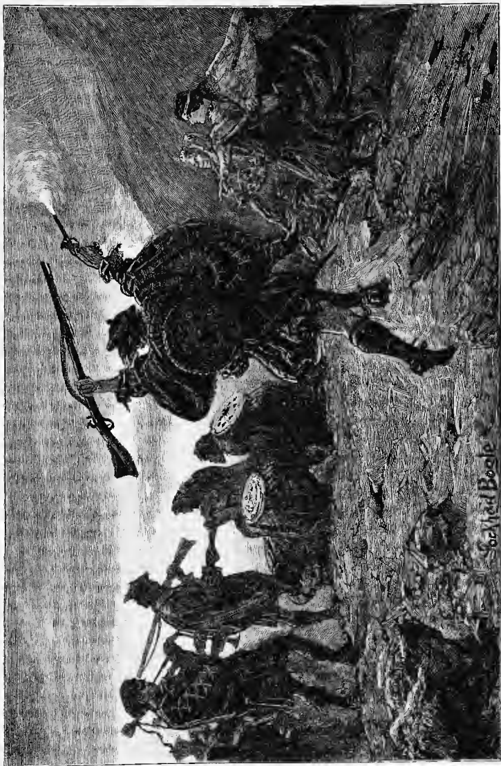
ROB ROY WELCOMED BY HIS CLAN.