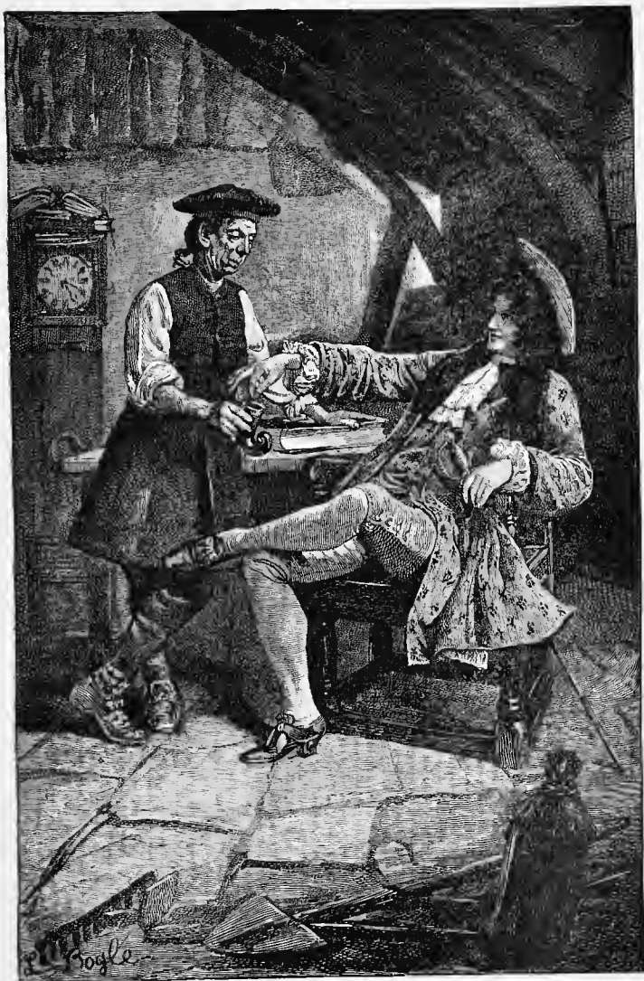
FRANK IN ANDREW FAIRSERVICE'S COTTAGE.