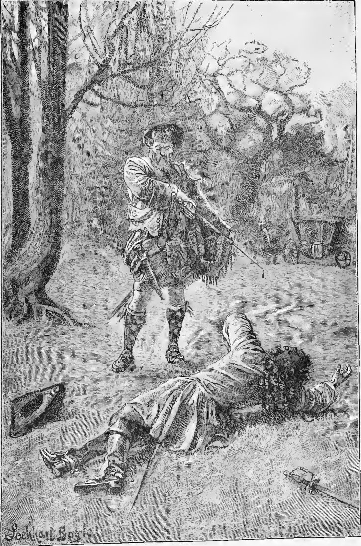
DEATH OF RASHLEIGH.