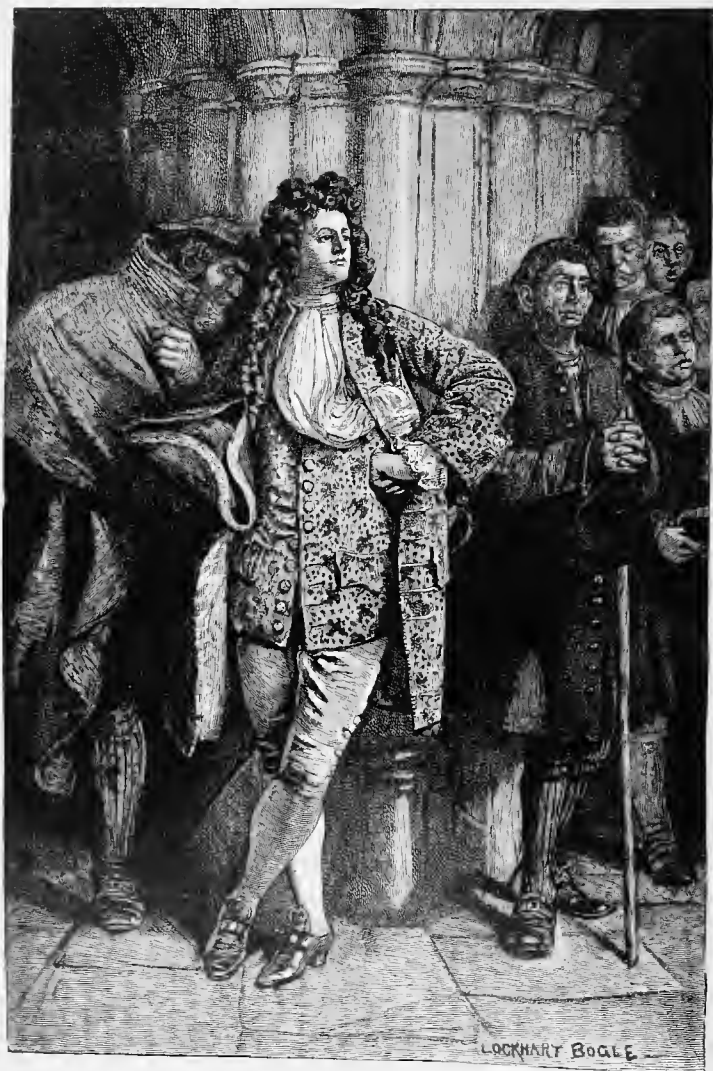
THE WARNING IN GLASGOW CATHEDRAL.