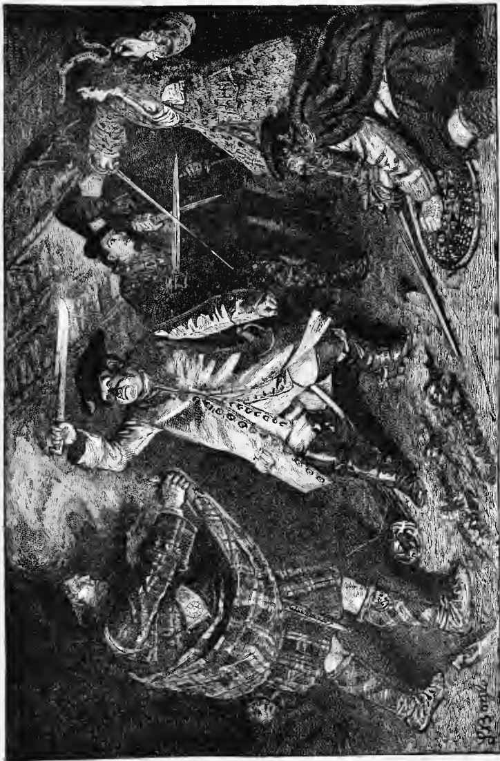
FIGHT IN THE INN AT THE CLACHAN OF ABERFOIL.