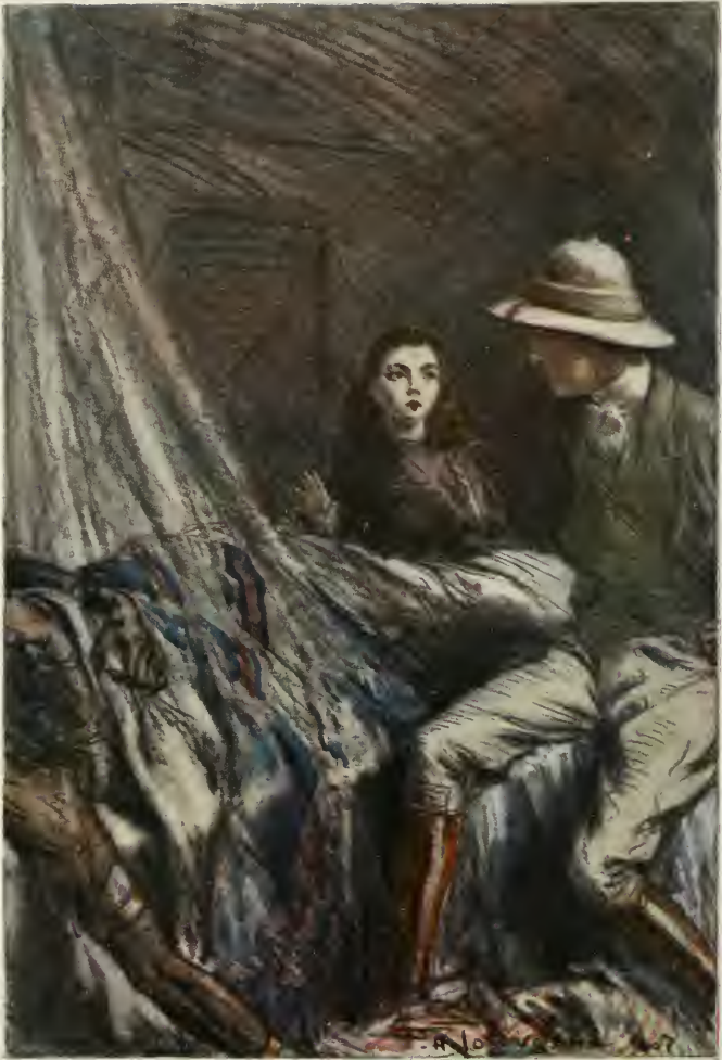
A SICK THING LAY IN BED.