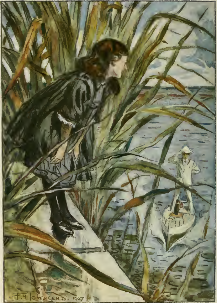
SOME ONE MOVED AMONG THE REEDS.