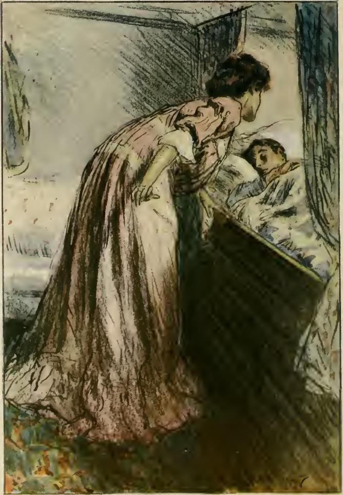
HE COULD ALMOST HAVE SWORN THAT THE KISS WAS REAL.