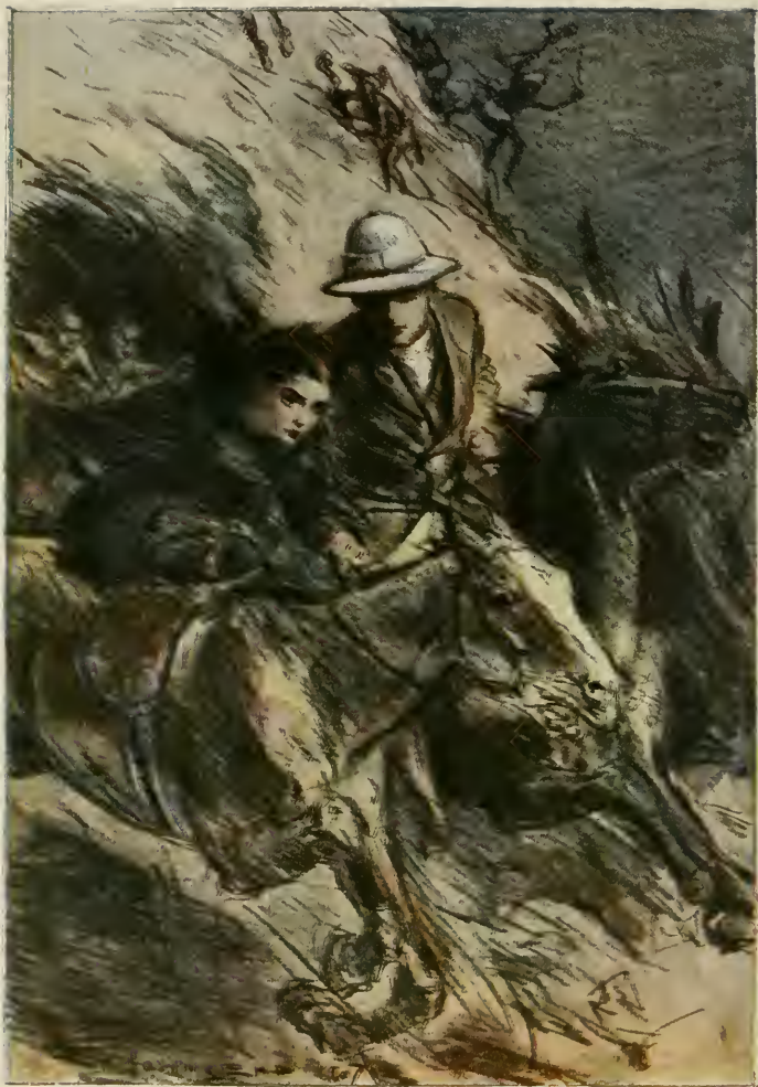
THE THIRTY-MILE RIDE.