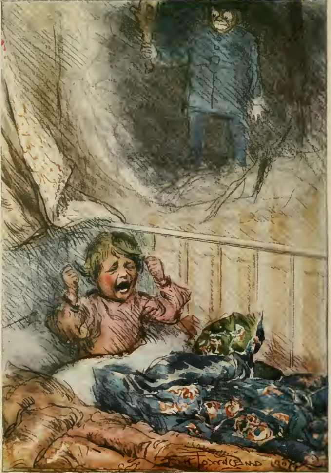
'IT WAS—IT WAS A POLICEMAN!'—p. 6.