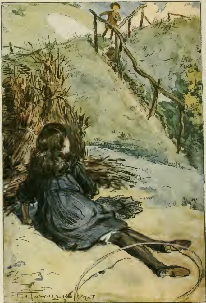
FIND HER WAITING FOR HIM.