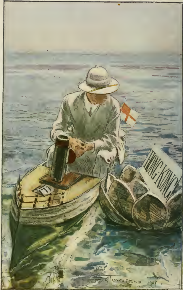
' THIS IS PRECISELY WHAT I EXPECTED HONG-KONG WOULD BE LIKE.