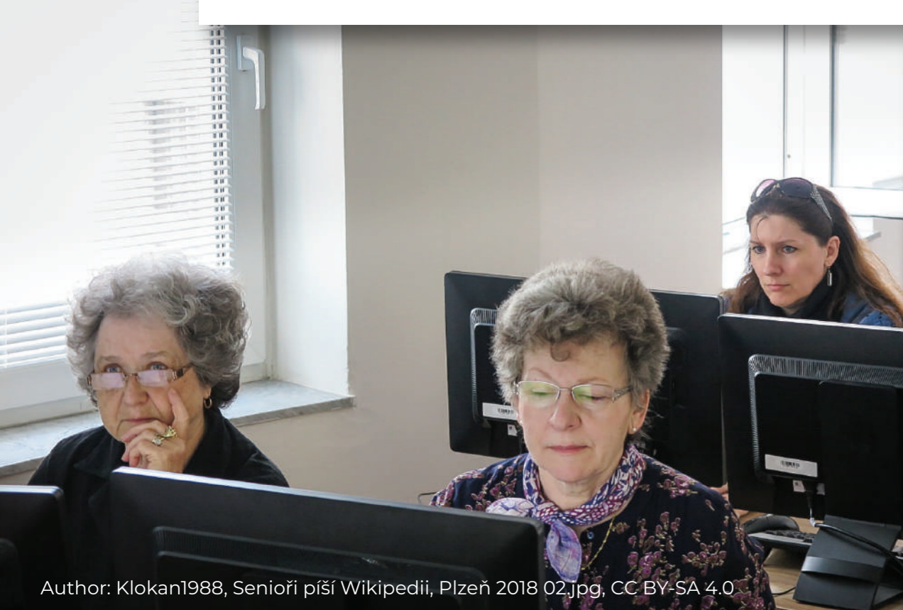
Author: Klokah1988, Seniři píší Wikipedii, Pížeň 2018 02.jpg, CC BY-SA 4.0

We are dedicated to working with libraries and librarians who often host and lead our courses. Through our courses and workshops, librarians learn how to use Wikipedia and pass on this skill. We work with libraries in the field of media literacy support and regularly involve them in the global campaign #LiblRef, i.e. one librarian = one citation added on Wikipedia.