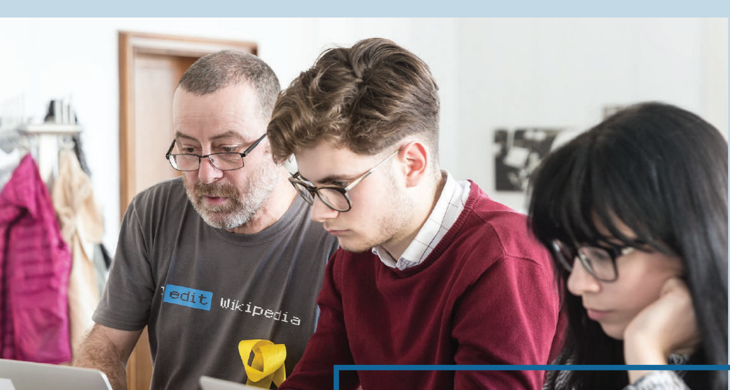
Author: Štěpán Pech, Editor: Shared Cities - Creative Moment, 11 34.jpg, CC BY-SA 4.0

Sign up for a course, come to one of our WikiClubs or read our editing guides. Live or online, there's something for everyone.