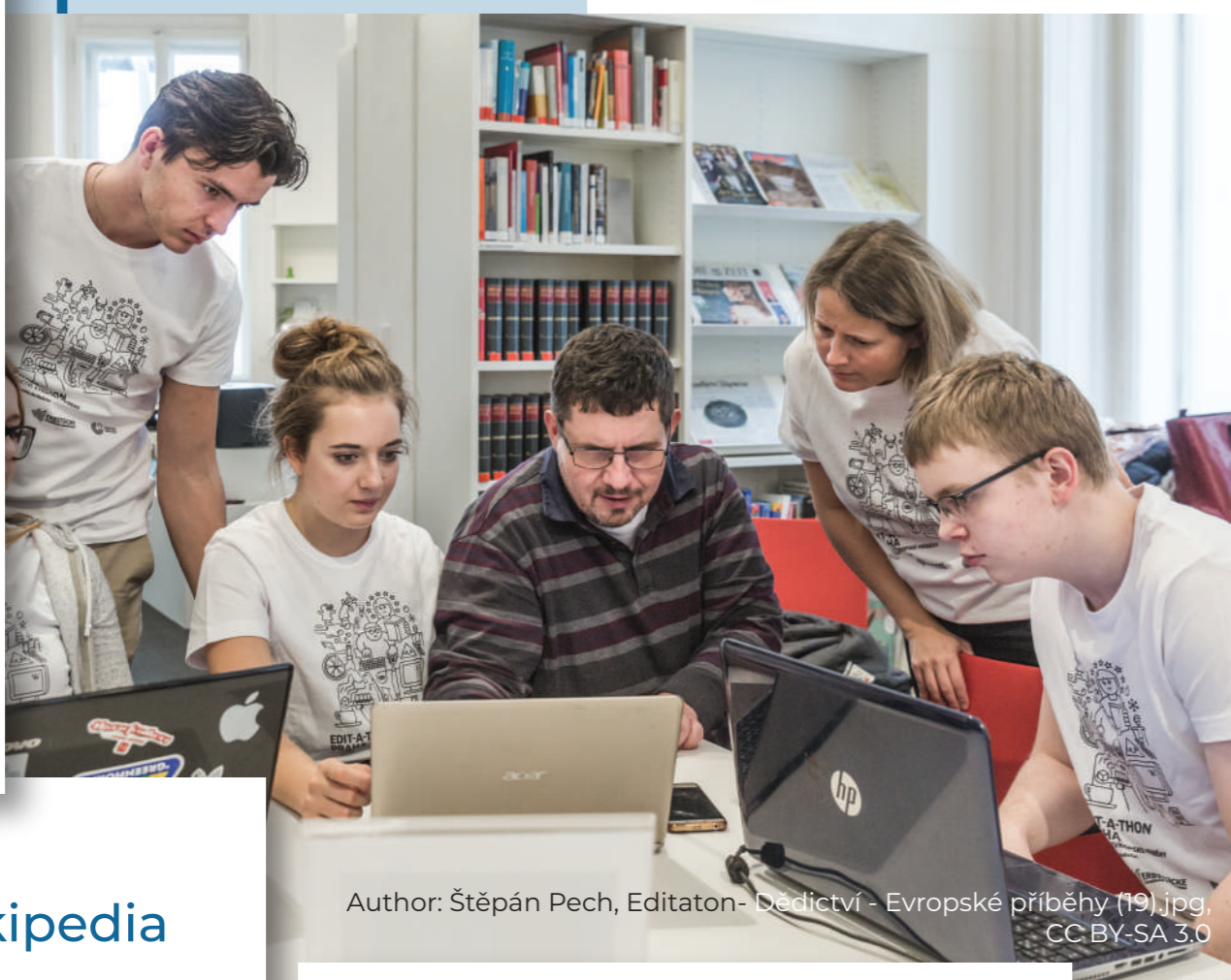
Author: Štěpán Pech, Editor: Křesťov, Evropské příběhy, Praha 2018 02.jpg, CC BY-SA 4.0

Wikipedia belongs to education. That's why we offer a wide range of collaborative activities for schools and educators, such as Wikipedia seminars, digital literacy or topical Wikipedia writing workshops. Contact us and we will create a tailor-made project for you.