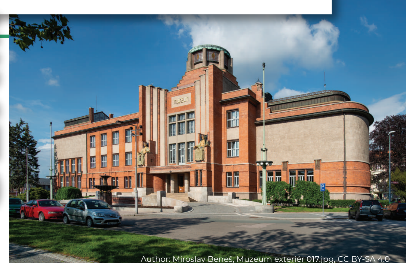
Author: Miroslav Běňáš, Muzeum exteriér 017.jpg, CC BY-SA 4.0