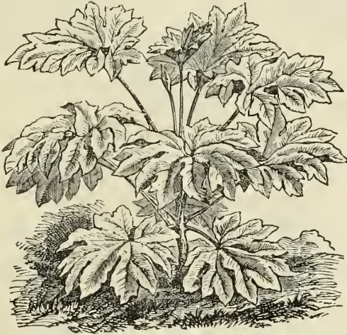
ARALIA PAPYRIFERA. Page 10.