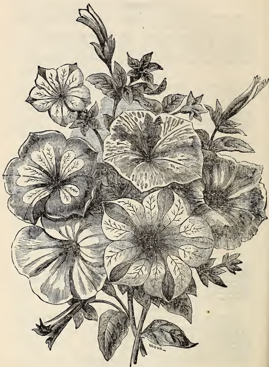
PETUNIA. Page 43.