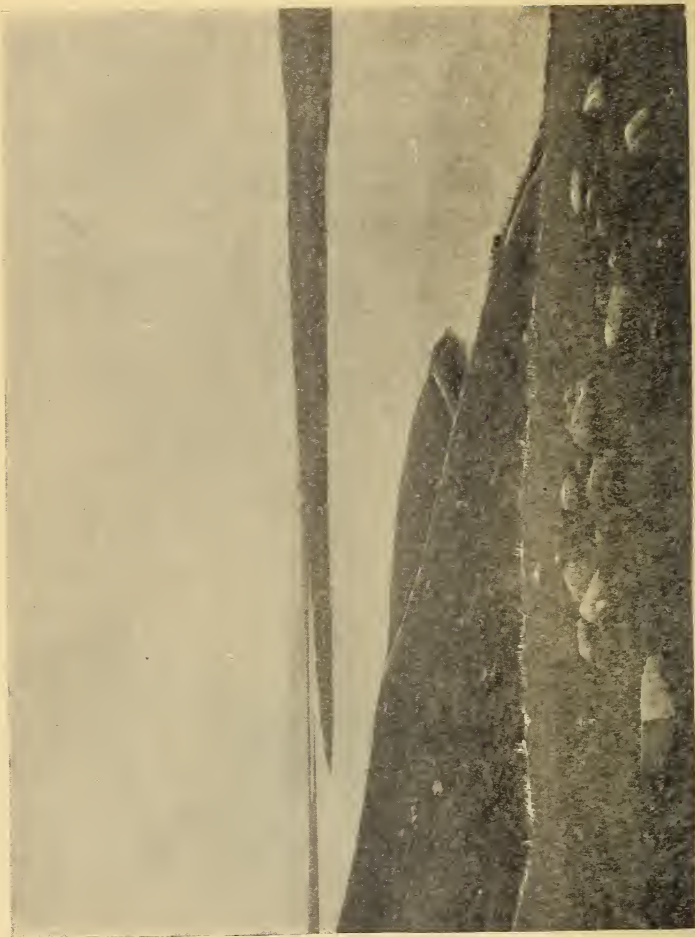
INDIAN GRAVES ON FORT HILL, MONTAUK